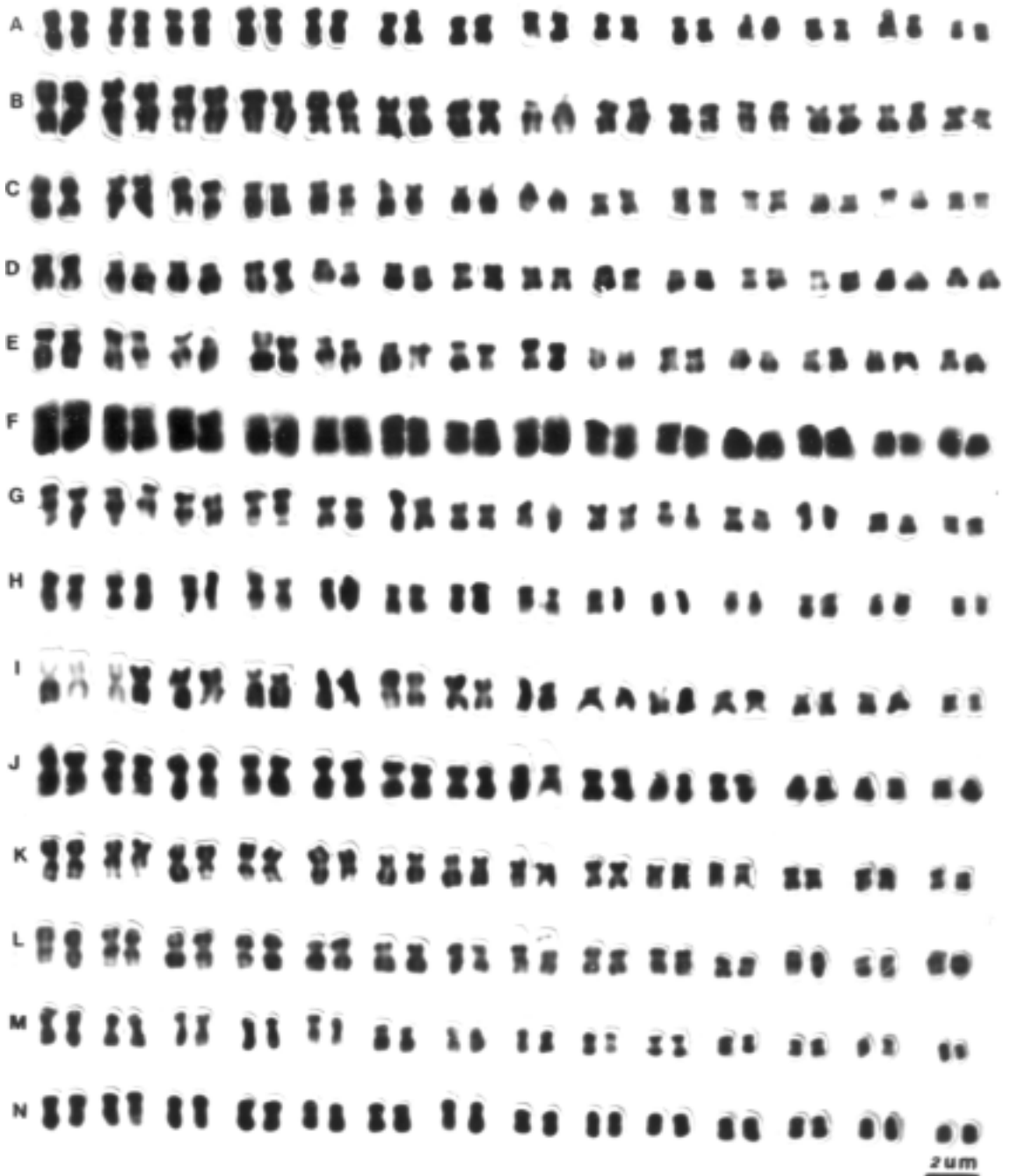
Figure 2. Karyotypes of Lobelia species. A. L. brasiliensis ; B. L. exaltata , Carmo de Minas; C. L. exaltata , São Bernardo do Campo; D. L. fistulosa , Águas de Lindóia; E. L. fistulosa , Carmo de Minas; F. L. hassleri ; G. L. imperialis var. imperialis ; H. L. imperialis var. kanitzii ; I. L. langeana ; J. L. organensis ; K. L. thapsoidea , Nova Friburgo; L. L. thapsoidea , Petrópolis; M. L. thapsoidea , Terezópolis; N. L. thapsoidea , Vale da Revolta. Bar = 2.0 μm.