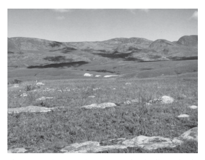
Figure 1. Rock outcrop between associated soils patches in "Serra do Cipó".

The Humic Entisol is the most common soil order associated with rock outcrops in the Mantiqueira Ranges.