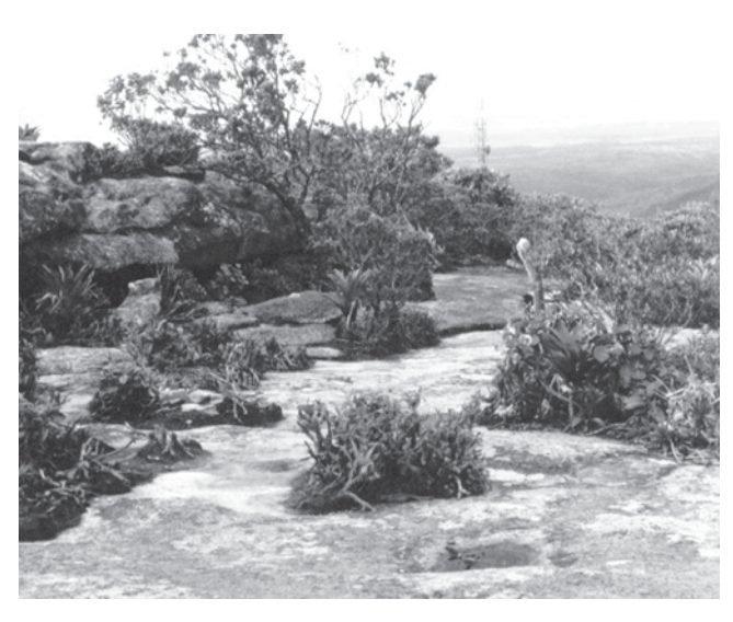
Figure 2. Islands of soil on rock outcrop landscape of the Diamantina plateau.