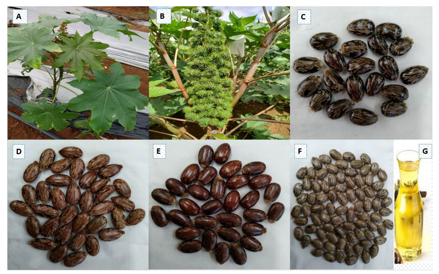
Figure 1. Castor; (A) young castor plant; (B) matured castor capsules; (C-F), different colors and varieties of castor seeds; (G) castor oil.

has low amount of saturated and polyunsaturated fatty acids and this enhance its stability (Yusuf et al., 2015). Like other vegetable oils, the composition and properties of castor oil vary with respect to the method of extraction, geographical location, and type of cultivar. The fatty acid profile of castor oil shares a higher similarity with that of macadamia nut, palm kernel, olive, and sunflower oil (Nor Hayati et al., 2009; Sinanoglou et al., 2014).