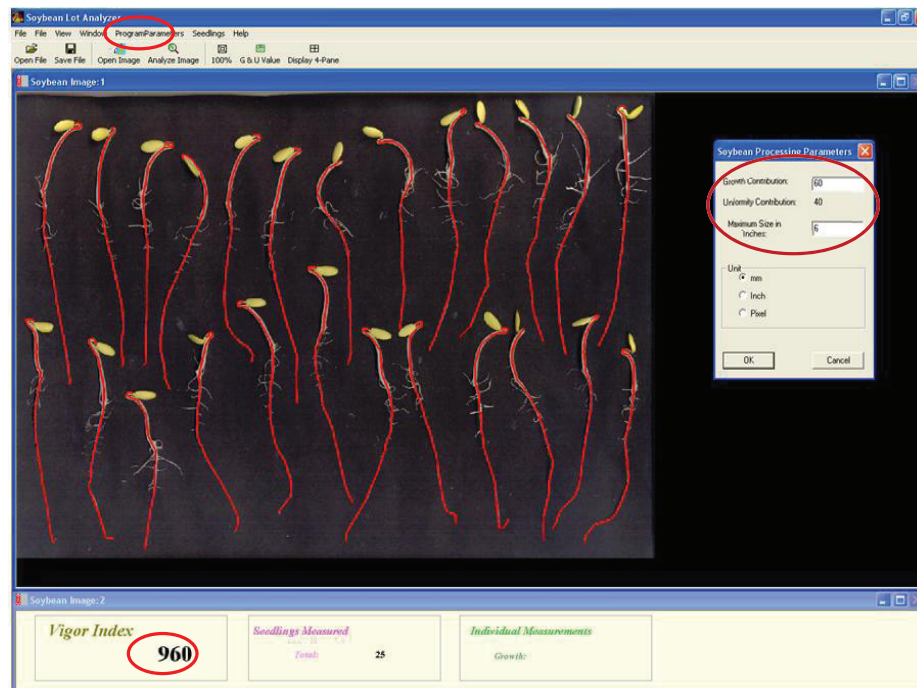
Figure 1. Digital images of cucumber seedlings, cv. Safira, assessed by the software SVIS® (Seed Vigor Imaging System). In highlight the menu indication “Program Parameters”, where are adjusted the estimated maximum size of 3 day-old seedlings (15.24 cm) and growth/uniformity ratio (60:40) are indicated for vigor index computation (960, in this seed sample).