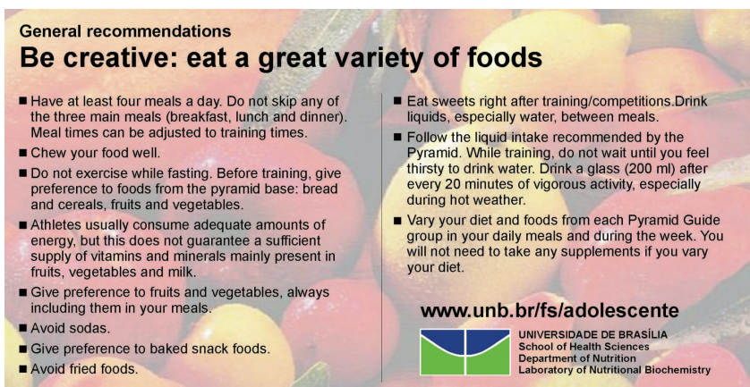
Figure 1. Food pyramid adapted to physically active adolescents.