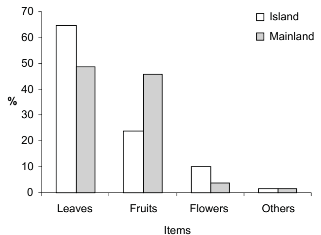
Figure 1. Annual percentage of records of consumption of food items for Alouatta caraya in riparian forests on island ( n = 573 ) and mainland ( n = 526 ).

The annual analysis between groups showed that leaves were the most commonly consumed plant part for both groups, though proportionately more so for the island group (65%) compared to the mainland (49%). Next came fruits, where on the island they comprised 24% and the mainland 46% of the diet (Fig. 1). Seasonally, fruits only surpassed leaves and the rest during the summer (45% on the island, 83% on the mainland) (Figs 2 and 3). During the summer, fruits of C. pachystachya were consumed very often for both groups (30.7% island, 65% mainland) as well as I. uruguensis (1.3% island only) and Ficus obtusiuscula (Miq.) Miq. (14% mainland only). Fruits were seldom consumed during the rest of the year on the island, while on the mainland they continued to be commonly consumed (45% in the fall, 35% in the winter) and was predominantly F. guaranitica in the fall (27%) and Phoradendron sp. in the winter (24%).