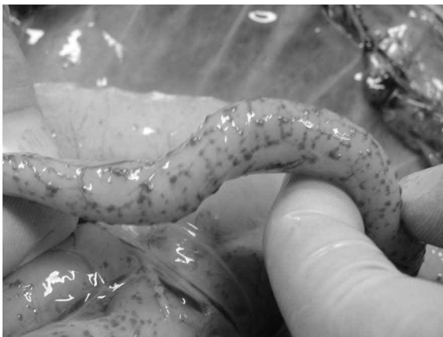
Figure 2. Detail of dark linear nodules on the serous surface of the small intestine of a Chelonia mydas specimen.