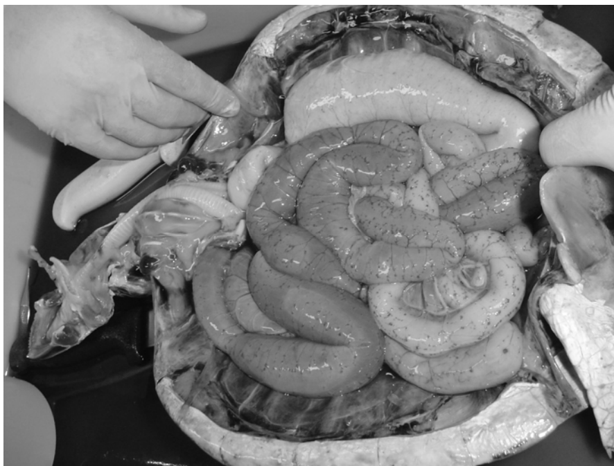
Figure 1. General view of a Chelonia mydas specimen with numerous dark linear nodules in both large and small intestines.