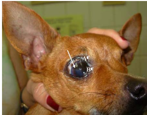
Figure 4. Photograph of the right eye of an adult Pinscher after removal of the nictitating membrane flap. Note the presence of a transparent cornea at visual axis (white arrow), secondary corneal melanosis in the remaining visual axis (A), and remnants of conjunctivalization (B).