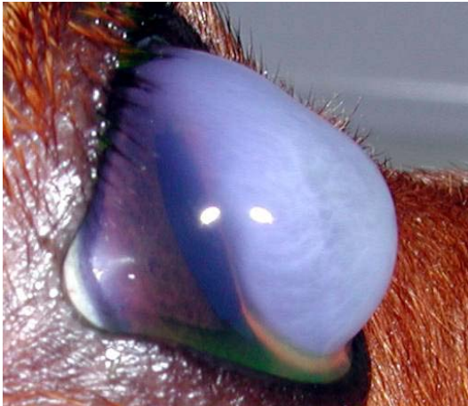
Figure 1. Photograph of the right eye of an adult Pinscher with bullous keratitis. Note the presence of corneal edema, irregularities in corneal curvature (keratoconus), and the absence of fluorescein staining.