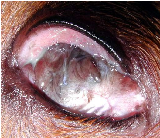
Figure 3. Photograph of the right eye of an adult Pinscher 60 days after superficial keratectomy and placement of a 360° conjunctival flap. Note the extensive conjunctivalization.