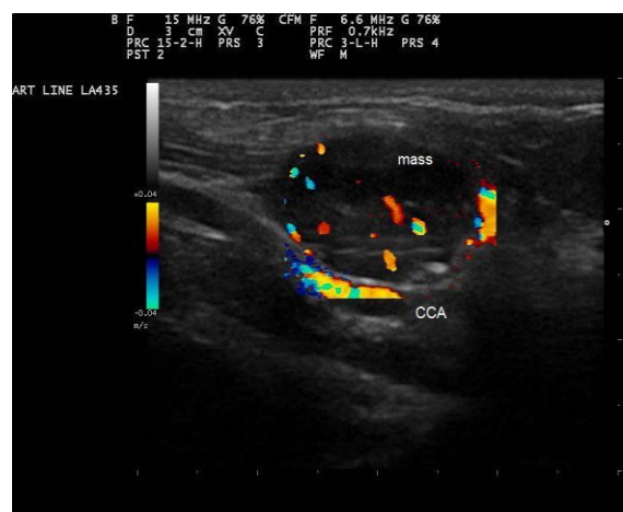
Figure 4. Dog. Sagittal plane of color Doppler mapping of ventral neck region showing a well vascularized tumor and mass effect leading to a reduction of the vessel caliber of the common carotid artery (CCA) in a dog.