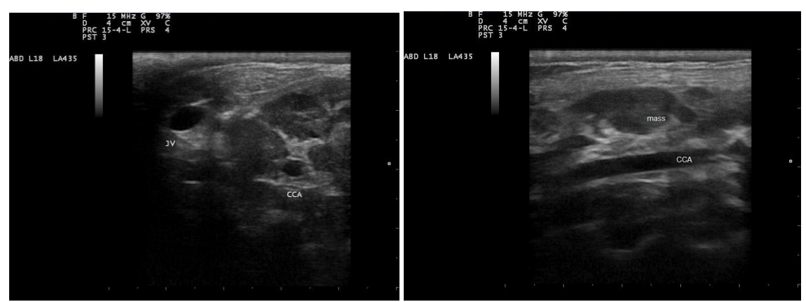
Figure 2. Dog. A) Transversal section of thyroid mass with no adherence to the vessels (characterized by dynamic maneuvers), jugular vein (JV) and common carotid artery (CCA) with apparent tumor encasement. B) Sagittal plane showing that there is no vessel invasion.

Figure 1. Dog. Common carotid artery (CCA) with loss of bright hyperechogenic layer in the contact area with neoplasic mass of the vessel wall. Color Doppler mapping shows mass vascularization.