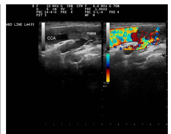
Figure 5. Dog. Color Doppler sonography of a huge echoic mass into the lumen of the common carotid artery (CCA) near the bifurcation of the internal carotid artery – chemodectoma in an eight year old Boxer.

LANGMAN, A.W.; KAPLAN, M.J.; DILLON, W.P.; GOODING, G.A. Radiologic assessment of tumor and the carotid artery correlation of magnetic resonance imaging, ultrasound, and computed tomography with surgical findings. Head Neck , v.11, p.443-449, 1989.