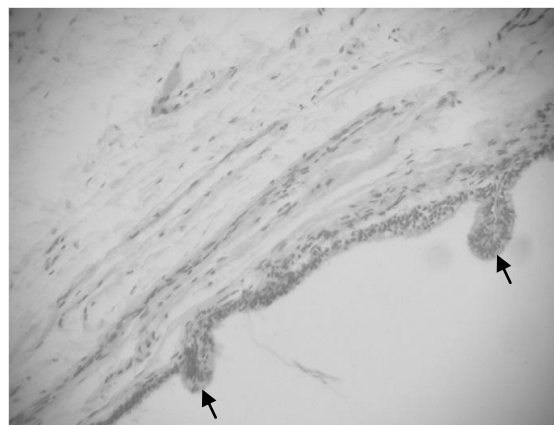
Figure 4. Mare. Decrease in the number of folds (arrows) in the uterine tube infundibulum mucosa.

Some alterations were observed in the mucosa. The epithelial lining of the uterine tubes ranged from columnar ciliated to simple squamous. The simple squamous epithelium was seen in areas corresponding to ampulla and infundibulum (Figure 5), which were the regions with the more distended lumen, and regions where the epithelium found in normal mares is columnar intermittently ciliated.