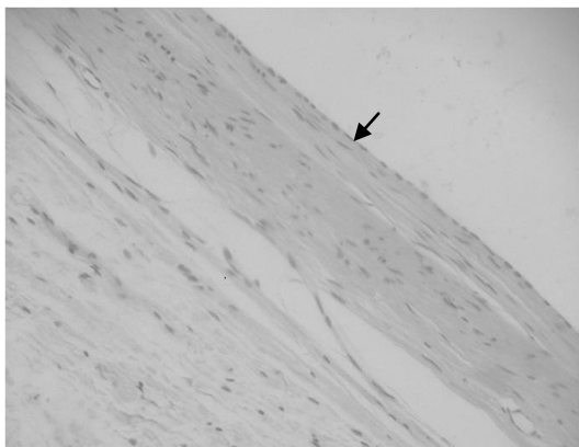
Figure 5. Mare. Simple squamous epithelium (arrow) Simple epithelium appears to replace the cylindrical epithelium that is typical of this region in uterine tube

Some alterations were observed in the mucosa. The epithelial lining of the uterine tubes ranged from columnar ciliated to simple squamous. The simple squamous epithelium was seen in areas corresponding to ampulla and infundibulum (Figure 5), which were the regions with the more distended lumen, and regions where the epithelium found in normal mares is columnar intermittently ciliated.