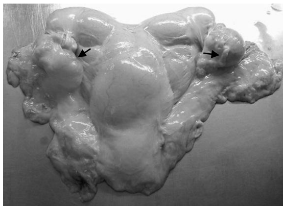
Figure 1. Mare reproductive tract showing enlarged oviducts (arrows).

Uterine tubes were separated from the reproductive tract, measured and pictures were taken (Figure 2).