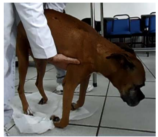
Figure 1. Dog, Boxer, female, eleven years old, with proprioceptive deficits in all four limbs.

radiography of thorax and cervical spine, which showed no changes. In myelography the attenuation of ventral and dorsal line of contrast in the lateral projection and attenuation of the lateral line of contrast in the ventrodorsal projection the third of the region's fifth cervical vertebra (Figure 2A and 2B) were observed.