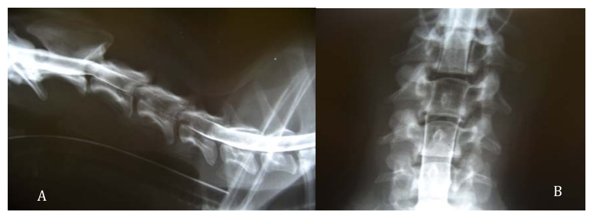
Figure 2 A. Myelography of the cervical spine. A. In the lateral projection, the attenuation of ventral and dorsal contrast lines in the third region of the fifth cervical vertebra is observed. B. In the ventrodorsal projection, there is attenuation in lateral contrast lines in the third region of the fifth cervical vertebra.