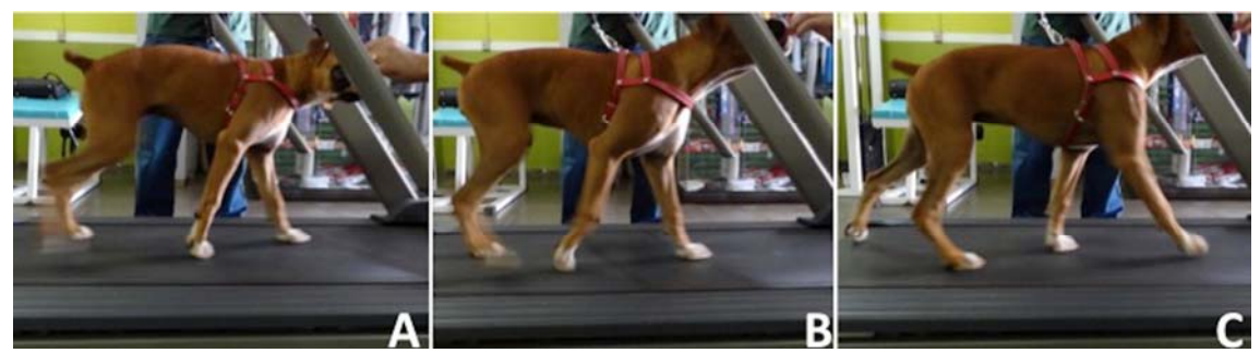
Figure 3. Swing phase and subphases. (A) initial swing: beginning of the flexion of TL and PL joints to lift the limbs from the ground. (B) intermediate swing: all the TL and PL joints are flexed. (C) final swing: TL and PL touch the treadmill.