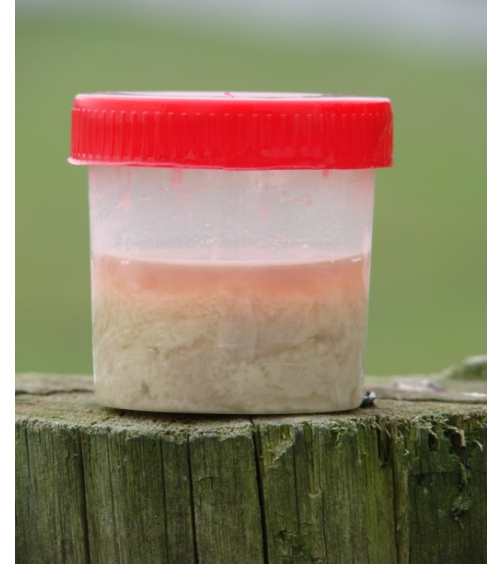
Figure 2. Urine of cloudy appearance and presence of thick lump sediment collected by spontaneous urination, representing infectious process.

Treatment included electrolyte replacement with 0.9% sodium chloride intravenously (IV), totaling 180 liters, of these, 40 liters administered on the first day and another 20 liters for daily maintenance for seven days. A diuretic (furosemide) 4mg/kg, IV, SID was also used for two days. Associated with penicillin benzathine antibiotic therapy 30.000IU/kg, IM, every 48 hours for six days.