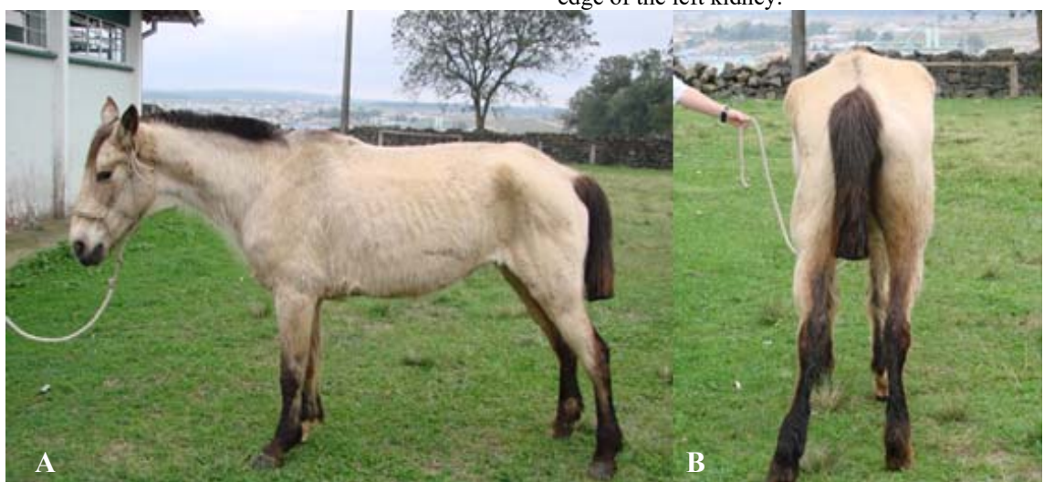
Figure 1. Equine, female, Campeiro breed, 15 years old, with chronic renal failure due to ascending pyelonephritis predisposed by cauda equina syndrome showig evident ribs and posture (1. A.) and evidence of coxal tuberosity, in a caudal view, characteristics of animal with lean nutritional status.

According to the clinical history, since it was acquired a year before presentation, the animal had urinary incontinence and recurrent episodes of cystitis, evolving into progressive weight loss, anorexia, apathy, reluctance to move and isolation from the group. No changes were observed on physical examination in vital parameters, however, rectal temperature did not provide reliable information due to anal sphincter relaxation and consequent air within it. The animal was lethargic, in standing position and nutritional status was considered thin (Figure 1). The mucous membranes were pink and uremic breath was evidenced during the inspection of the oral cavity. The abdominal auscultation revealed hypomotility in the four quadrants. Neurological examination showed incoordination characterized by ataxia and hind limbs paresis, tail hypotonia, perianal region hypoalgesia, anal sphincter relaxation and urinary incontinence. Rectal palpation showed distended rectum by air (pneumorectum) with few feces retention, bladder sagging and no changes in the caudal edge of the left kidney.