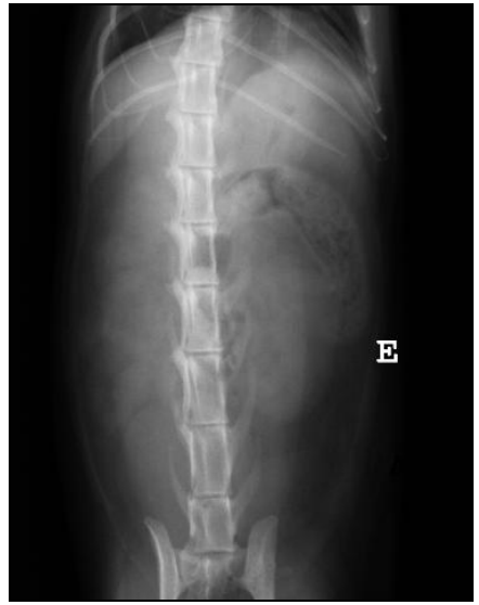
Figure 2. Radiographic image of a 3 years old mixed breed feline on ventrodorsal projection. The right renal silhouette is not visible. The left renal silhouette (key) is elongated at a more caudal location than usual, with size above the limits of normality for the specie, measuring 3.3 times the length of L2 vertebral body. Diagnostic Imaging Sector EV-UFMG, 2016.

Subsequently, iohexol (Omnipaque TM - GE Healthcare 300mg/ml) non-ionic iodinated contrast agent was administered 600mg/kg (2ml/kg) intravenously in bolus. Sequential radiographs on right and left VD projections were performed at times: immediate (Figure 3 A and E) 15 minutes using compressive abdominal bandage and 20 and 40 minutes after contrast injection.