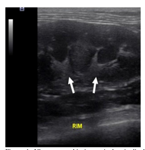
Figure 1. Ultrasonographic image in longitudinal plane of a 3 years old mixed breed feline. In the left lateral abdominal region an elongated structure compatible with the kidney was observed. Preserving the cortical echogenicity and maintaining the corticomedullary definition however with two pelvises (arrows). Diagnostic Imaging Sector EV-UFMG, 2016.

The patient was hospitalized for supportive therapy administration and received Ioimbina