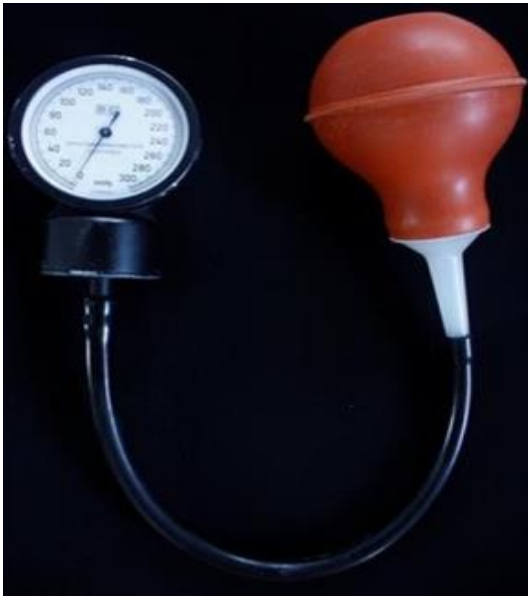
Figure 3. Equipment used to control external pressure exerted upon the ventral surface of the cervical trachea during the application of the compressive technique.

Compression strength was controlled via a closed circuit engulfing a conventional calibrated manometer attached to a rubber bulb – as per Canola and Borges (2005) – via a 25cm plastic sleeve (Fig. 3). All radiographic images were further analyzed in a DICOM (digital imaging and communication in medicine) format via specific software (Onís 2.5 free version).