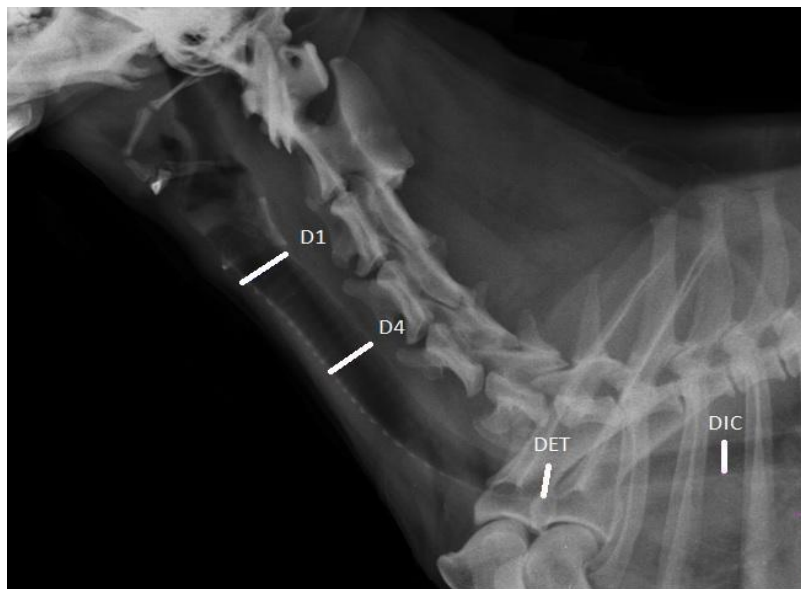
Figure 2. Radiographic image of the cervicothoracic region via a lateral right-facing screening that reveals the localized readings for all variables involved in the measurement of the trachea's internal diameter. D1 (tracheal internal diameter at the first tracheal ring zone); D4 (tracheal internal diameter at the region between the fourth and fifth cervical vertebrae); DET (tracheal internal diameter at the thoracic inlet); and, DIC (tracheal internal diameter at the second intercostal space region).