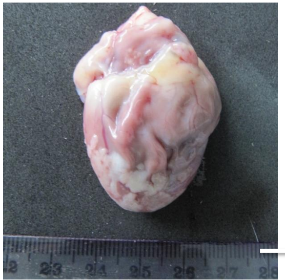
Figure 1. Heart. Multifocal fibrinous epicarditis. Multifocal, soft, whitish fibrinous exudate, with up to 2cm in diameter, located mostly at the apex of the heart.

Grossly, soft, multifocal to coalescing, whitish fibrinous exudate, measuring up the 2cm of thickness was observed in the epicardium, mostly at the apex of the heart (Figure 1). Moreover, the liver was severely icteric, with multifocal nodules, resembling pyogranulomas, associated with fibrin deposition in the capsule (data not shown). Additionally, multifocal nodules were also observed in the spleen, lungs, and mesentery of the intestines (data not shown).