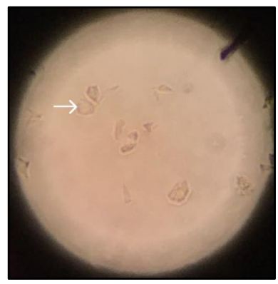
Figure 1. Image of the vaginal cytology of Myrmecophaga tridactyla . Note the superficial enucleated and scaly cells (arrow).

from uterine infection to estrus, and a recent copula. In order to make the definitive dismissal of the diagnosis of uterine infection, ultrasound was performed.