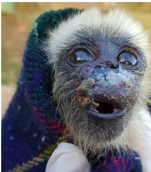
Figure 4. Healing is noted from the third day, after facial surgical intervention with muscular rearrangement and with the use of healing ointment.

In this patient, during palpation of the physical examination, no crackles were observed in the nasal bones, only injuries to the musculature. There is still a discussion about the timing and the most appropriate technique for the surgical approach, it is believed that decisions should be based on variables such as injury complexity, presence of other fractures on the face, and presence of septal injury. The most commonly used treatment for nasal fractures has been closed reduction with local anesthetic, the result being often considered satisfactory by the doctor and the patient (Borguese et al. , 2011). In pediatric patients, such as this baby howler monkey and, due to some complications (hypovolemic shock and a small puppy), a careful evaluation by trauma using local anesthesia or physical restraint has become difficult to make more specific decisions in the face of the condition. For this reason, sedation in non-human primates is essential for the success of facial correction.