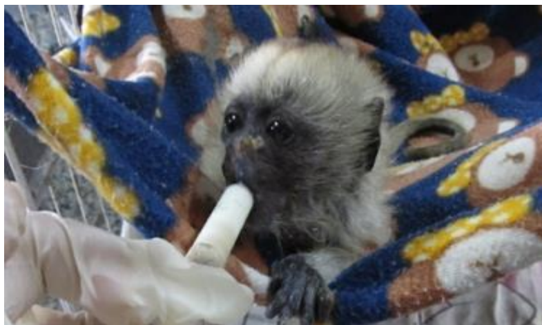
Figure 3. Howler Monkey feeding after 33 days of recovery. During this period, the animal already performed lip sucking movements.