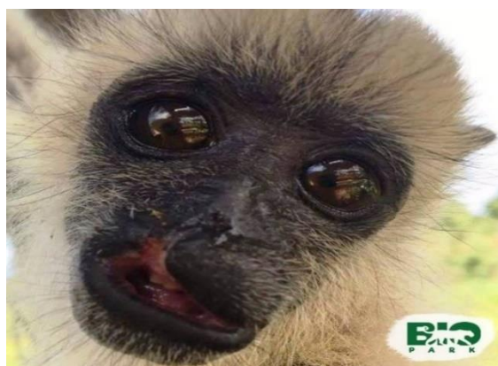
Figure 5 - Still young, the Howler Monkey was transferred by the Wild Animal Rehabilitation Center to Bonito City Zoo - MS, BIOPARK. She was inserted in an enclosure and adopted by another group of primates of the same species and is clinically well. Check it out at: https://www.facebook.com/bioparkbonitoms/photos/a.303098310422394/361514147914143/?type=3 . Accessed in Jan. 2019.

temporary maintenance of animals, the patient was transferred to the Zoo of Bonito City - Mato Grosso do Sul 60 days after being attended. In the new institution, he was placed in an enclosure and adopted by another group of primates of the same species and is clinically well (Figure 4). The monkey receives food on an equal basis with other individuals of the same species and is exposed in the park visitor grounds. (Figure 5).