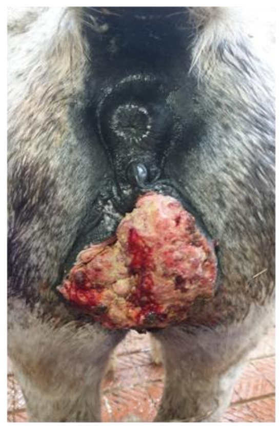
Figure 1. Appearance of tumoral tissue on the lips of the vulva in the mare.

On clinical examination, the general condition of the mare was good. In the examination of the genital area with inspection and speculum, no lesion was found in the area up to the cervix, and the wound was limited to the posterior part of the vagina and the lips of the vulva. It was observed that the vaginal mass did not damage the anal sphincter. Rectal palpation and transrectal ultrasonography showed normal genital organ morphology. Tissue samples were taken for histopathological examinations after clinical examinations. samples Tissue histopathological examinations were fixed in 10% formalin solution. Approximately 5μm thick sections were prepared from paraffin blocks prepared by routine methods, stained with the hematoxylin-eosin (H&E) method (Luna, 1968), and examined under a light microscope.