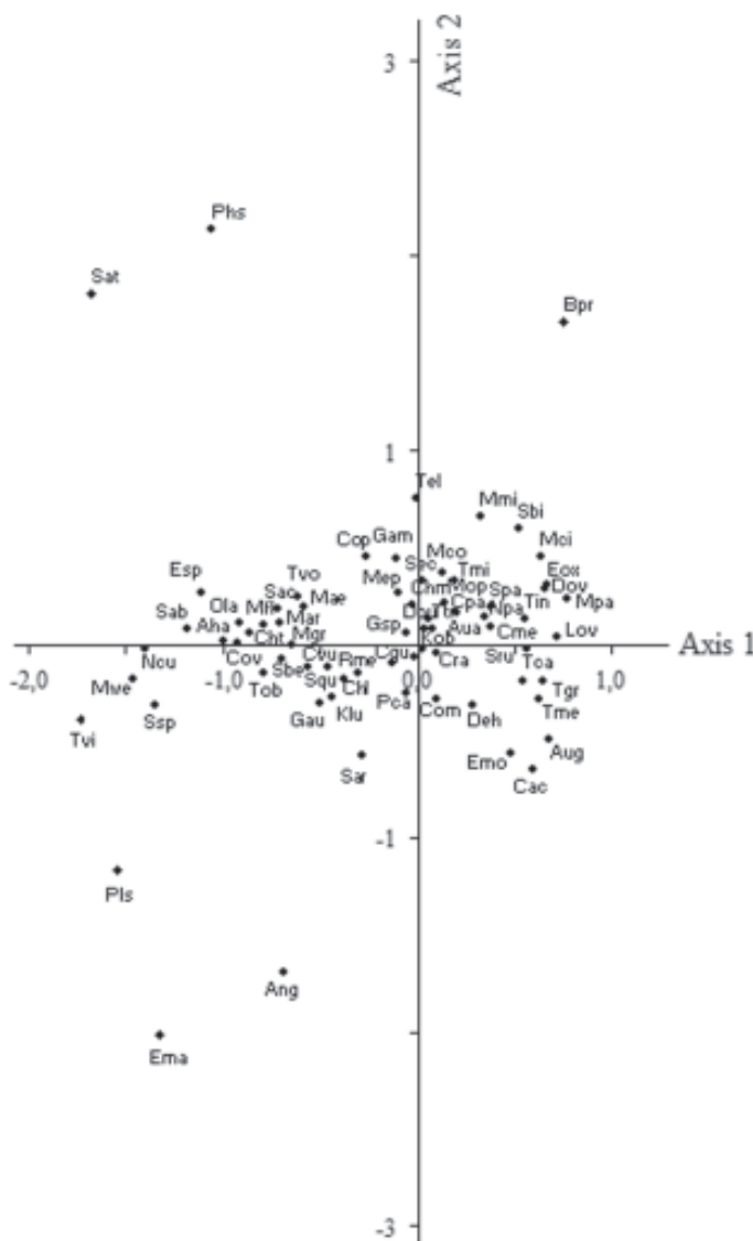
Figure 3. CCA ordination of the phytoplanktonic species found in the Mundaú reservoir, Northeastern Brazil. Abbreviations: Aha = Actinastrum hantzschii ; Ang = Ankistrodesmus gracilis ; Aug = Aulacoseira granulata ; Aua = A. granulata var. angustissima ; Bpr = Botryococcus protuberans ; Cac = Closteriopsis acicularis ; Chl = Chroococcus limneticus ; Chm = C. minutus ; Cht = C. turgidus ; Cme = Cyclotella meneghiniana ; Com = Coelastrum microporum ; Cop = C. pseudomicroporum ; Cov = Cryptomonas ovata ; Cpa = Closterium parvulum ; Cqu = Crucigenia quadrata ; Cra = Cylindrospermopsis raciborskii ; Cvu = Chlorella vulgaris ; Deh = Dictyosphaerium ehrenbergianum ; Dpu = D. pulchellum ; Dov = Diploneis ovalis ; Ema = Eunotia major ; Emo = E. monodon ; Eox = Euglena oxyuris ; Esp = Euglena sp.; Gam = Geitlerinema amphibium ; Gau = Gomphonema augur ; Gra = Golenkinia radiata ; Klu = Kirchneriella lunaris ; Kob = K. obesa ; Lov = Lepocinclis ovum ; Mae = Microcystis aeruginosa ; Mar = Monoraphidium arcuatum ; Mci = M. circinale ; Mco = M. contortum ; Mep = Merismopedia punctata ; Mfl = Microcystis flos-aquae ; Mgr = Monoraphidium griffithii ; Mmi = Merismopedia minima ; Mop = Monoraphidium pusillum ; Mpa = Microcystis panniformis ; Mwe = M. wesenbergii ; Ncu = Navicula cuspidata ; Npa = Nitzschia palea ; Ola = Oocystis lacustris ; Pca = Pseudanabaena catenata ; Phs = Phacus sp.; PIs = Pleurosigma sp.; Pte = Pediastrum tetras ; Rme = Raphidiopsis mediterranea ; Sab = Scenedesmus acuminatus var. bernardii ; Sac = S. acuminatus ; Sar = S. arcuatus ; Sat = S. acutus ; Sbe = S. bernardii ; Sbi = S. bicaudatus ; Sec = S. ecornis ; Squ = S. quadricauda ; Spa = S. quadricauda var. parvus ; Sps = Spirulina sp.; Sru = Synedra rumpens ; Ssp = Scenedesmus sp.; Tca = Tetraedron caudatum ; Tel = Tetrastrum elegans ; Tgr = Tetraedron gracile ; Tin = T. incus ; Tme = T. mediocris ; Tmi = T. minima ; Tob = Trachelomonas oblonga ; Ttr = Tetraedron triangulare ; Tvi = T. victoriae ; Tvo = Trachelomonas volvocina .

generally require a considerable luminosity and high temperatures. They are also more resistant to nutrient depletion, particularly nitrogen (Dokuil & Teubner 2000). Oscillatoriales are typical of high turbidity environments and low luminosity conditions (Reynolds 1997). Self-shadowing, due to the considerable development of