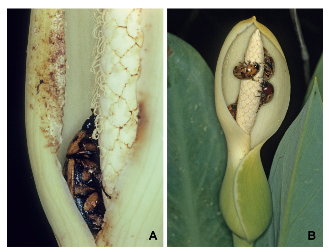
Figure 5. An inflorescence in the second night in the staminate stage, with male flowers producing pollen grains in form of chains, which are eaten by beetles coming out of the tube and crawling upwards. A. Probably, a C. ohausiana beetle eating pollen. B. Several C. ohausiana individuals in search of remnants of pollen shortly before flying away. The length of the beetles is ca. 1.8 cm.

Figure 4. Xanthosoma striatipes at Indianópolis, State of Minas Gerais. A. One individual of Cyclocephala ohausiana (left) and an individual of C. atricapilla (right) have approached a warm and smelling spadix in the pistillate stage. B. An opened inflorescence in the pistillate stage. Several individuals of C. ohausiana and probably also of C. atricapilla in the basal tube are contacting the receptive stigmas and gnawing on sterile staminate flowers. The length of the beetles is ca. 1.8 cm.