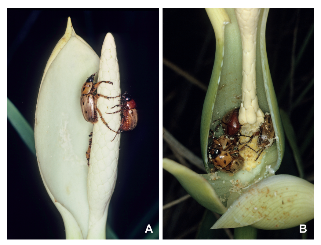
Figure 4. Xanthosoma striatipes at Indianópolis, State of Minas Gerais. A. One individual of Cyclocephala ohausiana (left) and an individual of C. atricapilla (right) have approached a warm and smelling spadix in the pistillate stage. B. An opened inflorescence in the pistillate stage. Several individuals of C. ohausiana and probably also of C. atricapilla in the basal tube are contacting the receptive stigmas and gnawing on sterile staminate flowers. The length of the beetles is ca. 1.8 cm.

Distant populations of a Xanthosoma (Araceae) species have different floral scents but the same cyclocephaline beetle pollinators