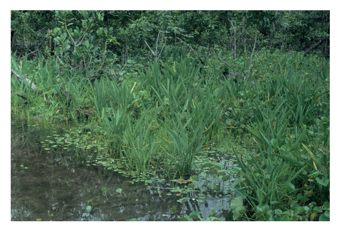
Figure 2. The large X. striatipes population in Codó, State of Maranhão, growing in a swamp.

Identification of the components was carried out using the mass spectral libraries Wiley 9, Nist 2011, FFNSC 2, and Adams (2007), as well as the database available in MassFinder 3. Some of the compounds were confirmed by comparing their mass spectra and retention times with those of standard components available in the reference collection of the Plant Ecology Laboratory of the University of Salzburg. Samples from ambient air were used to discriminate between contaminants and inflorescence scents.