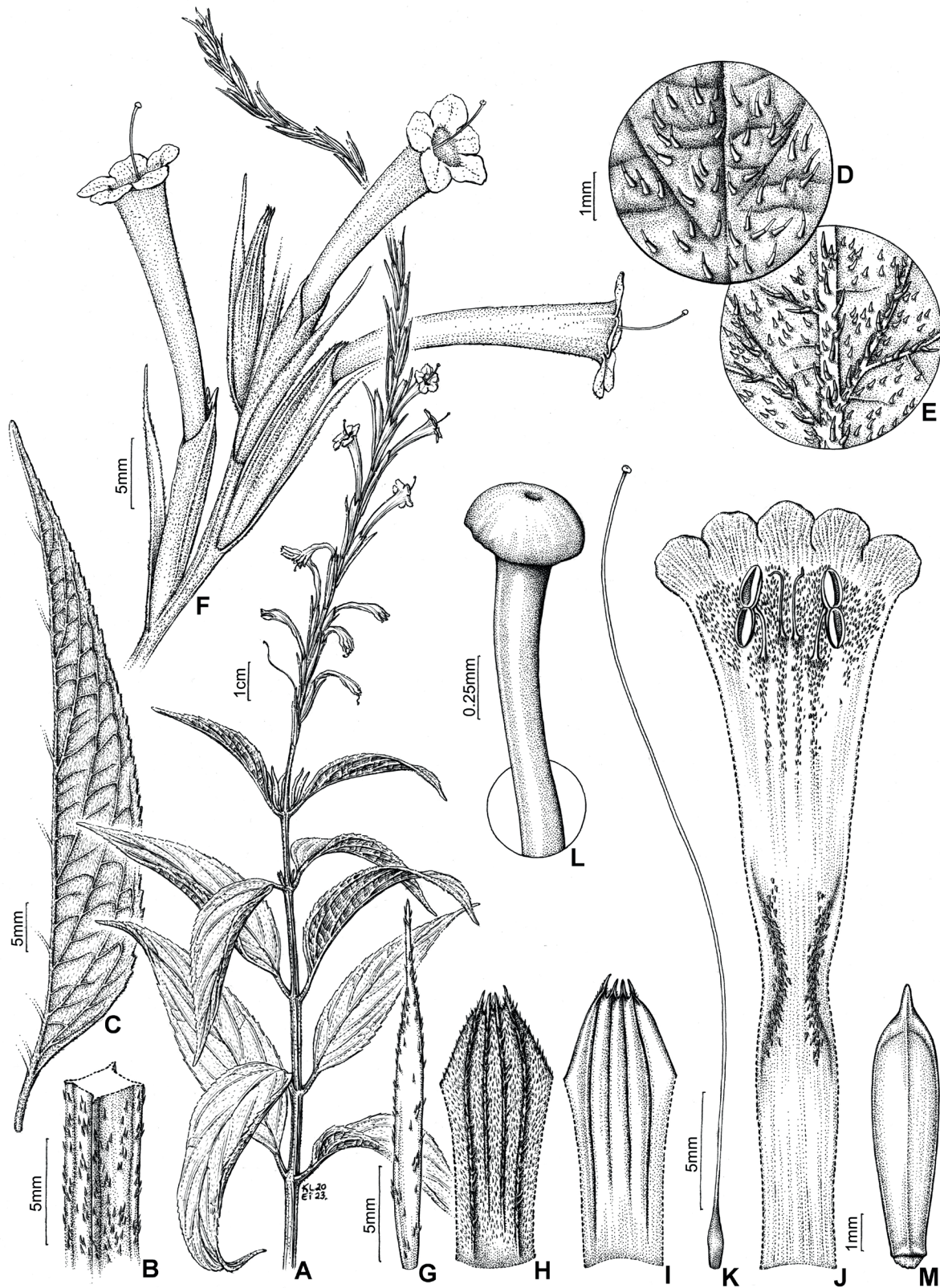
Figure 1. Stachytarpheta lajedicola . A - Branch with inflorescence. B - Detail of the branch, showing the well-developed edge. C - Leaf abaxial surface, showing margin and veins. D - Leaf adaxial surface, detail of the pubescence. E - Leaf abaxial surface, detail of the pubescence. F - Detail of the inflorescence, showing rachis, bracts, and flowers. G - Bract, abaxial surface. H , I - Calyx dissected, showing the teeth, external and internal view, respectively. J - Corolla dissected, showing the androecium and internal pubescence of the tube. K - Gynoecium. L - Detail of the stigma. M - Fruit. (P.H.A. Melo et al. 4786, illustrated by Klei Sousa).