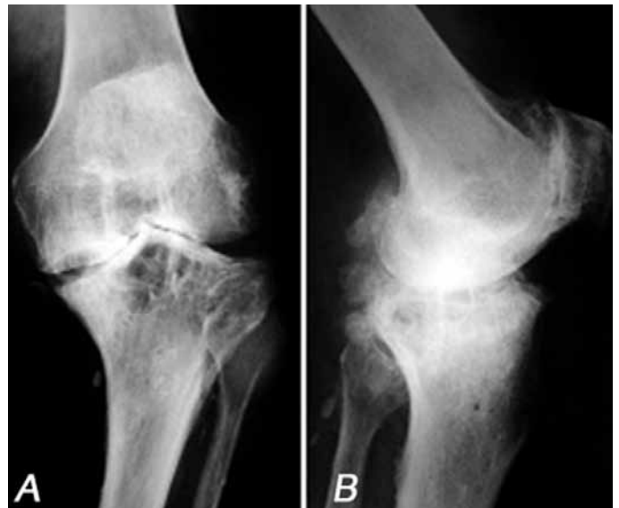
Figure 1 – Radiographic appearance of a patient with severe genu varus who underwent the proposed technique.

The early postoperative stage was conducted routinely, with the use of unfractionated heparin for 21 days and physical antithrombotic measures (elastic stocking and physiotherapy). Return visits were arranged for the first, fourth and eighth weeks after the operation, and thereafter every two months, until graft integration was achieved. Weight bearing was