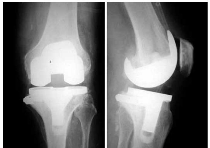
Figure 3 – Final radiographic appearance.

The stability provided only by the Kirschner wires and screws was not shown to be sufficient after a careful manual test. Moreover, the anchorages for the screws are rarely secure, which motivated us to add a support plate with a containment belt.