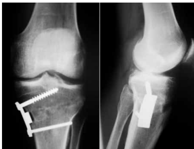
Figure 1 – Medial open wedge osteotomy fixed with Puudu plate.

A retrospective assessment was made on all the patients who underwent medial opening wedge HTO above the tubercle that was fixed using a Puudu plate (Figure 1), performed between October 1, 1987, and October 30, 2008, at the Celso Pierro Hospital and Maternity Hospital, Pontifical Catholic University of