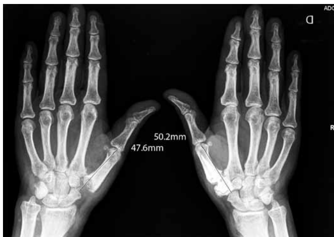
Figure 1 – Patients operated bilaterally using two different techniques.

evaluation was based on four items: pain, function, mobility and strength. Radiographic evaluations were made before and after the operation, using anterior, lateral and stress views. The height difference in the scaphoid-metacarpal column (i.e. the line joining the most distal point on the scaphoid to the most distal point on the first metacarpal) between the two hands of the same patient was calculated (Figure 2). The imaging evaluation also made it possible to assess implant placement, presence of radiolucency lines and preservation of the height of the scaphoid-metacarpal column.