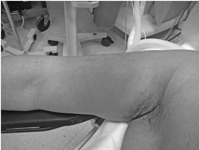
Figure 2 – Hyperemia in right arm.