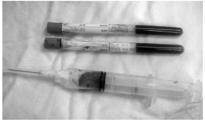
Figure 1 – Material collected for culturing.

Case 2 - The patient was a 31-year-old male bodybuilder from São Paulo, SP, who was attended as an outpatient with a complaint of pain and edema in his left arm. He had made use of anabolic steroids several times, and the last application was three days earlier, at the training place. On physical examination, he presented phlogistic signs at the location. The range of motion was painful and limited. He was admitted to the emergency service and underwent laboratory tests (hemogram, VHS and PCR) and imaging exami-