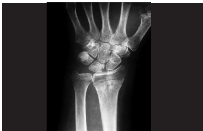
Figure 5 – Radiograph on wrist in posteroanterior view after removal of the Kirschner wires, showing the final result from treatment of the fracture of the distal radius.

Out of the 48 wrists that were treated surgically, 42 (87.5%) presented postoperative measurements within the limits that were considered adequate according to McQueen and Caspers. All the postoperative