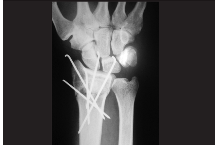
Figure 3 – Radiograph on wrist showing the immediate postoperative result in posteroanterior view, after fixation of the fracture of the distal radius using Kirschner wires, with correction of the radial angulation and restoration of the radial height.

introduced into the portal 6R, which is located in the sixth compartment of the extensor tendon, and was directed proximally and radially. All the Kirschner wires were positioned subcutaneously and the incisions were sutured (Figures 3 and 4).