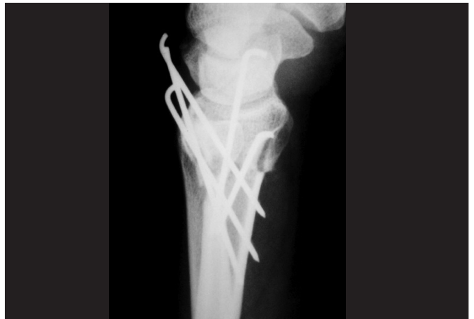
Figure 4 – Radiograph on wrist showing the immediate postoperative result in lateral view, with correction of the dorsal deviation of the distal radius.

The wrist was immobilized using a brace from the axilla to the palm for one week, to control rotation and minimize skin irritation caused by the Kirschner wires. After this period, the splint was removed and, after producing a control radiograph, it was replaced by a plaster cast from the axilla to the palm.