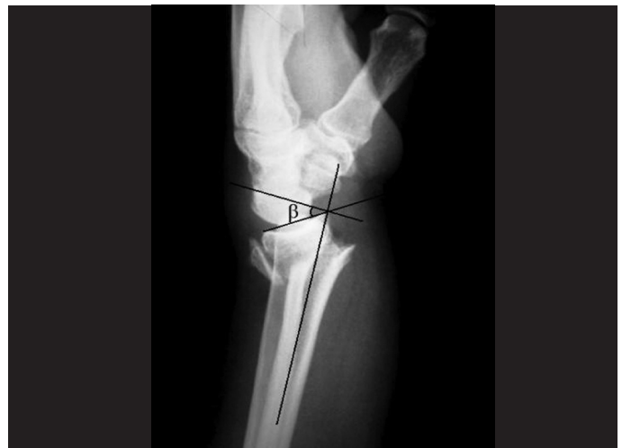
Figure 2 – Preoperative radiograph on wrist in lateral view, showing a fracture of the distal radius with metaphyseal dorsal comminution and dorsal deviation. The volar tilt ( \beta ) is demonstrated on the radiograph.

We used the postoperative radiographic parameters established by McQueen and Caspers for evaluating the results. These authors considered that the results would be adequate if the radial angle was greater than or equal to 19^\circ (normal: 24^\circ ) and if the volar angle was less than -12^\circ (normal: between 4^\circ and 12^\circ ).