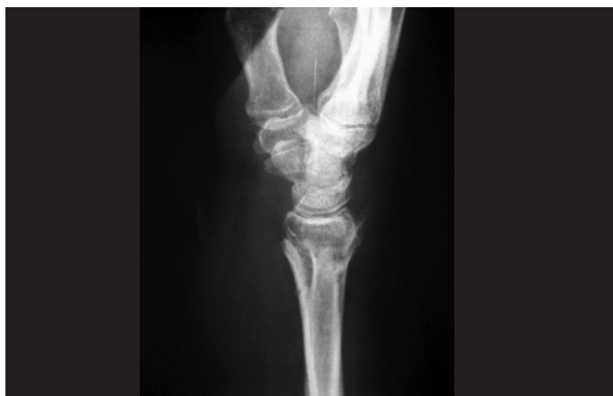
Figure 6 – Radiograph on wrist in lateral view after removal of the synthesis material, showing correction of the volar angulation of the distal radius.