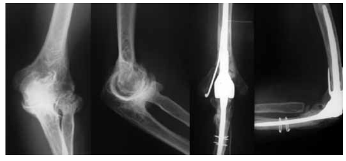
Figure 3 – Pre and postoperative radiography on patient with rheumatoid arthritis. Note fixation of fractures of the medial condyle and ulna that occurred during the operation.

breakage of the implant<sup>(2)</sup>, heterotopic ossification<sup>(1)</sup> and periprosthetic fracture<sup>(1)</sup>. Among the patients with nerve lesions (4/46), two presented neuropraxia (one of the ulnar nerve and one of the radial nerve). Complete tears occurred in two patients, in the median