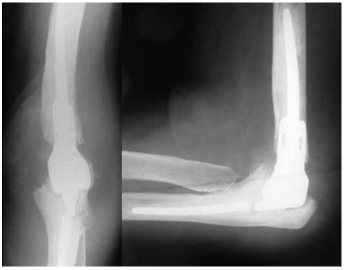
Figure 5 - Fracturing of the implant (ulnar component).