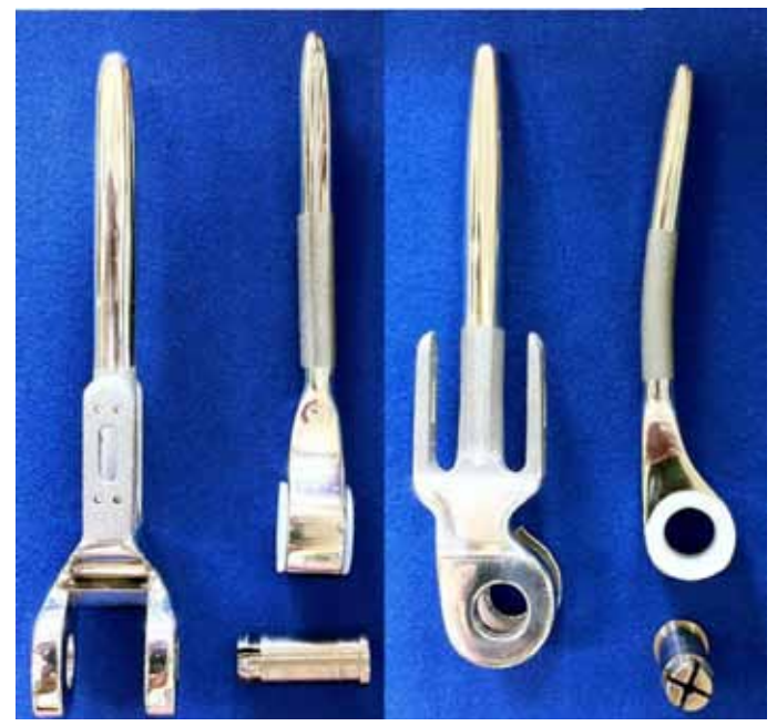
Figure 1 - Components of the prosthesis in frontal and lateral views.

The 46 procedures were performed between 2000 and 2009 in four services: IOT-FMUSP <sup>(17)</sup>, Santa Casa de Misericórdia de São Paulo <sup>(14)</sup>, ABC School of Medicine <sup>(10)</sup> and Federal University of São Paulo <sup>(5)</sup>.