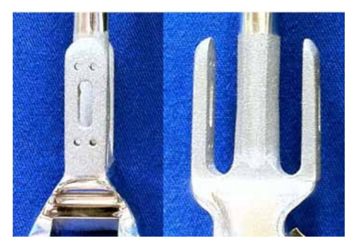
Figure 2 – Flanges (anterior and lateral views), with porous surface and perforations to facilitate osseointegration.

The criteria for indicating the surgical intervention were incapacitating pain without response to conservative treatment and/or functional limitation resulting from diminished range of motion or instability.