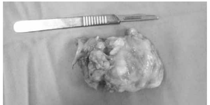
Figure 4 – Excised tumor.