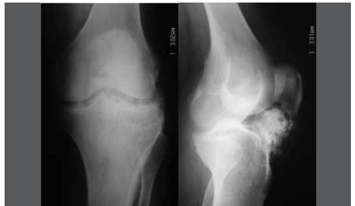
Figure 2 – Radiographs (anteroposterior and lateral views).