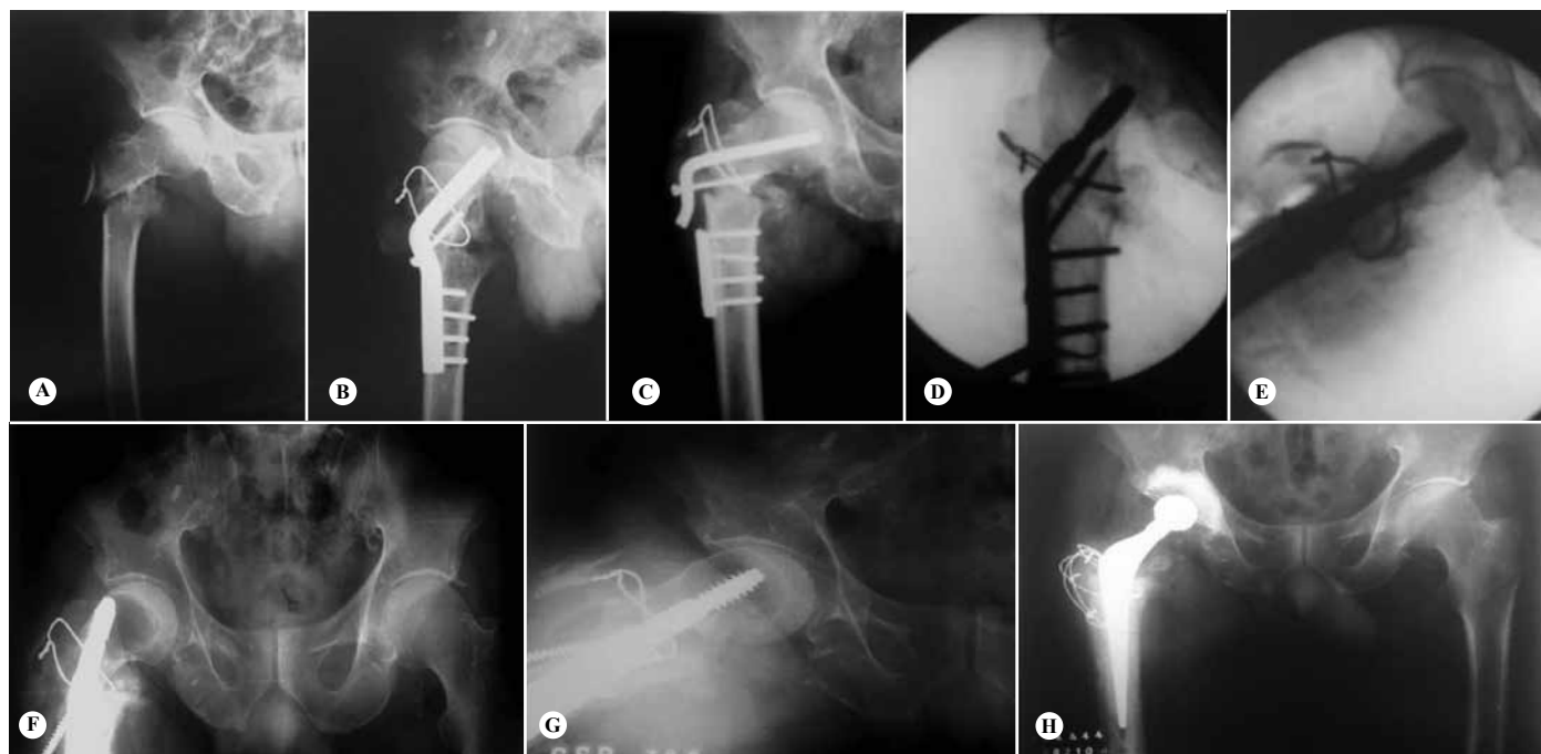
Figure 3 – 78-year-old patient with pseudarthrosis and failure of the material (A, B and C), who underwent osteotomy that was fixed with a DHS of 150° and valgization to 154° (D and E). After six months of follow-up without fracture consolidation or “cut out” of the material (F and G), it was decided to perform cemented total hip arthroplasty, which was achieved without intercurrances (H).

Fractures of the proximal femur are subjected to intense mechanical forces in small segments of bone, which reach 1250 lb/cm 2 of compression on the medial side and 1000 lb/cm 2 of tension on the lateral side, for every 100 lb (13) , thus requiring implants with trustworthy fixation. Consolidation of these fractures will depend especially on anatomical reduction and maintenance of the irrigation of the proximal femur, through the medial branch of the femoral circumflex artery. Other relevant anatomical data include the normal cervical-diaphyseal angle (between 124 and 136°) and the line that joins the center of the femoral head to the tip of the greater trochanter, which forms an angle of 90° (variation from 85-95°) with the mechanical axis of the femur (12-14) .