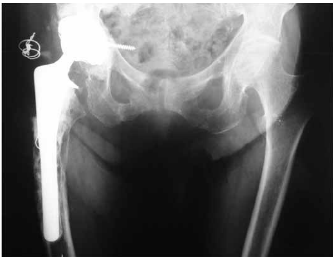
Figure 7 – Anteroposterior radiograph of the hip, produced 20+2 years after the operation.