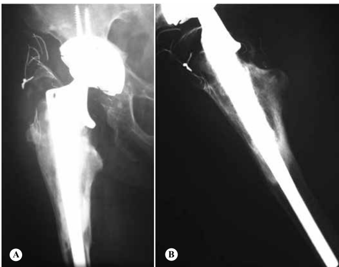
Figure 4 – Anteroposterior (AP) radiograph (A) and lateral radiograph (B) produced 21 years after the operation.

femoral implant (Charnley prosthesis) was observed, associated with severe bone deficiency in the proximal third of the femur, thus characterizing a femoral defect of AAOS type III (4) . In relation to the acetabular implant, no signs of instability of the component were observed (Figure 5). The laboratory markers for infection were shown to be within the normal range.