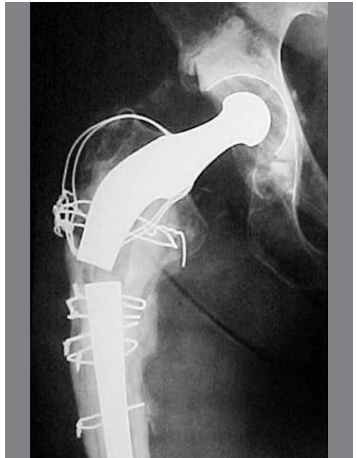
Figure 5 – Radiograph on 66-year-old female patient showing signs of loosening and fracturing of the femoral component, with AAOS type III femoral defect (4) .

After 12 years of follow-up, the Harris Hip Score (5) was 78 points. Radiographically, it was observed that the implant was stable, with graft reabsorption in Gruen zone II (6) . The allograft had consolidated at the graft-host bone junction, and migration of the greater trochanter (0.5 cm) had occurred, with breakage of the cerclage threads (Figure 6 A, B and C).