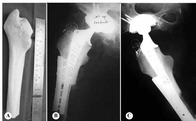
Figure 2 – (A) Circumferential proximal femoral allograft. (B) Anteroposterior (AP) radiograph produced during immediate postoperative period. (C) Lateral radiograph produced during immediate postoperative period.

abduction and flexion exercises, six weeks after the operation, and full weight-bearing on the leg was allowed three months after the operation.