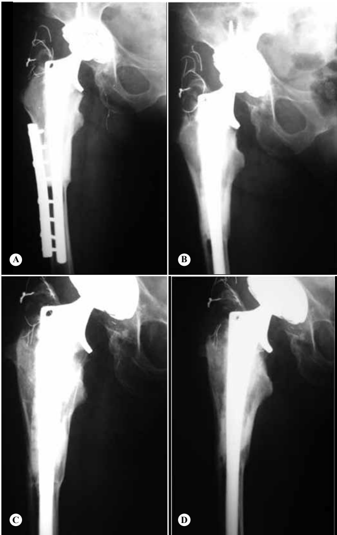
Figure 3 – (A) Radiograph produced two years after the operation. (B) Radiograph produced seven years after the operation. (C) Radiograph produced 12 years after the operation. (D) Radiograph produced 17+1 years after the operation.