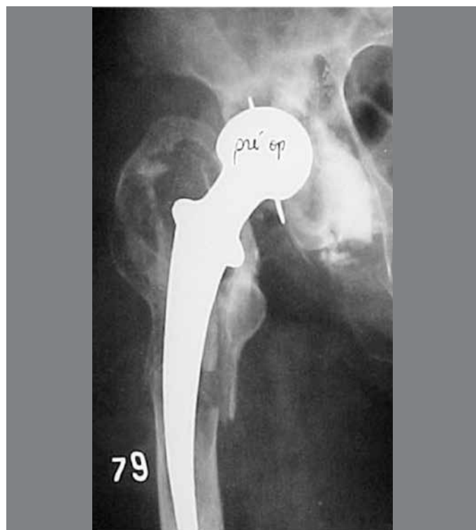
Figure 1 – Radiograph on 46-year-old female patient, showing signs of loosening of THA (Muller prosthesis), with AAOS type II acetabular defect and type IV femoral defect (4) .

In both cases, gentamicin in association with cefazolin was used as antibiotic prophylaxis for 10 days (during the hospital stay), and mechanical and medicinal thromboembolic prophylaxis was administered for 30 days. After the operation, the patient was allowed to walk with the aid of crutches and without placing weight on the operated leg, from the 10 th day onwards. The patient was guided to do active hip