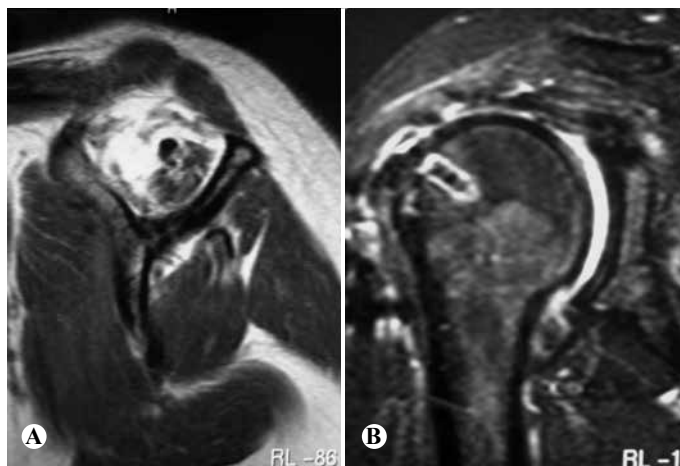
Figure 2 – (A) Preoperative magnetic resonance imaging, showing atrophy of the muscle belly of the supraspinatus; (B) postoperative magnetic resonance imaging, showing renewed tearing of the tendon of the supraspinatus, with UCLA = 10.

AC = adhesive capsulitis; SS = suprascapular; Re-RCI = renewed tearing of rotator cuff injury.