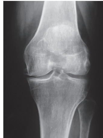
Figure 3 - Bipedal AP radiograph with weight-bearing.