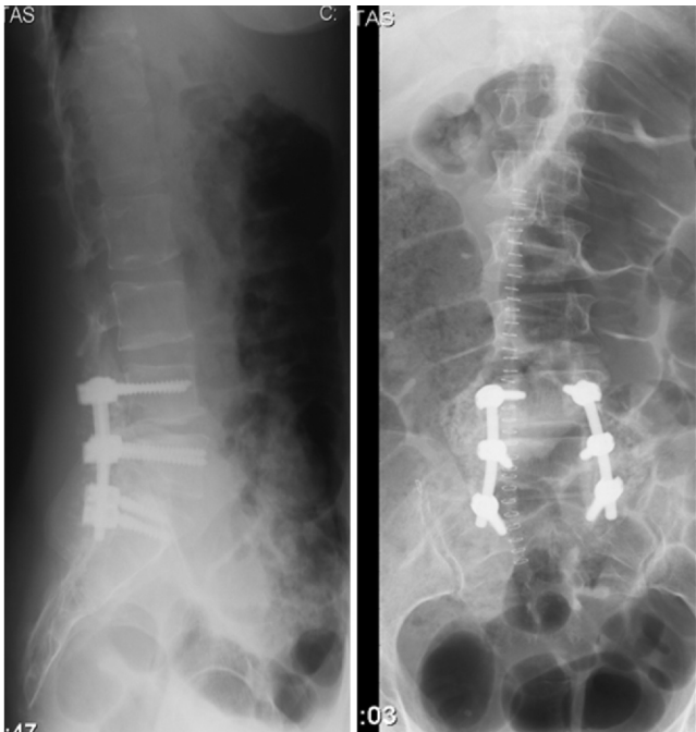
Fig. 3 – X-ray of the lumbar spine after surgery with arthrodesis at L4–S1.

It can be classified according to either its etiology or its anatomy. The etiological classification is divided into congenital stenosis and acquired/degenerative stenosis. Congenital stenosis is characterized by narrowing of the vertebral canal that is either idiopathic or secondary to bone dysplasia such as achondroplasia. Acquired/degenerative stenosis may occur as a result of metabolic disease (such as Paget's disease), tumors, infections, osteoarthritic alterations or instability with or without spondylolisthesis. The anatomical classification is used to identify specific areas of stenosis and is used as a "guide" to surgical decompression. Four types of stenosis can be defined: (1) central; (2) lateral recess; (3) foraminal; and (4) extraforaminal.