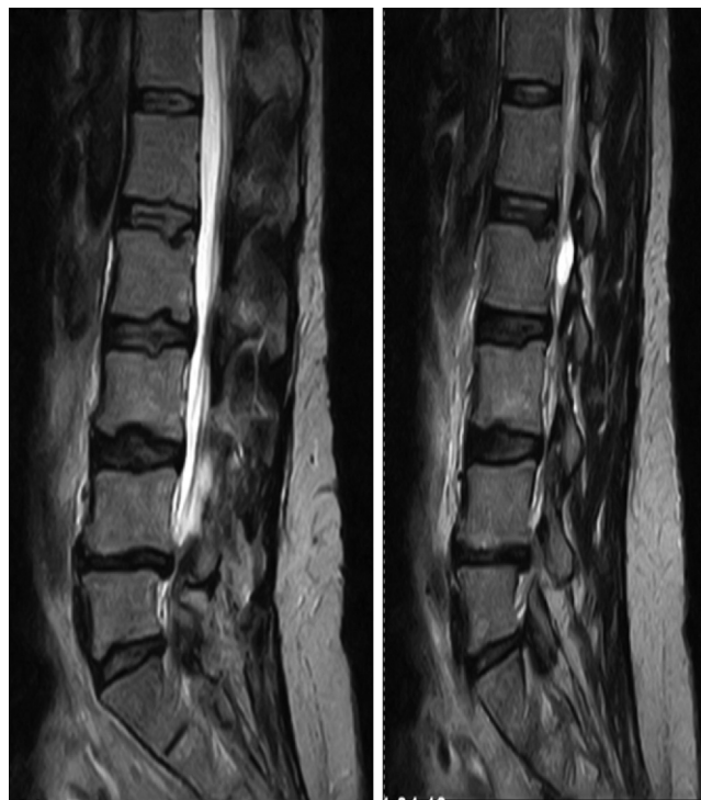
Fig. 1 – MRI of the lumbar spine (sagittal slice), in which lumbar stenosis can be seen at L2-S1.

(Figs. 1 and 2A and B). Electromyography was also performed on the lower limbs, and this revealed severe radiculopathy at L5 and S1.