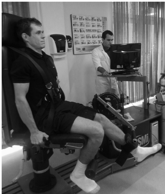
Fig. 1 – Photo of an individual positioned in the dynamometer.