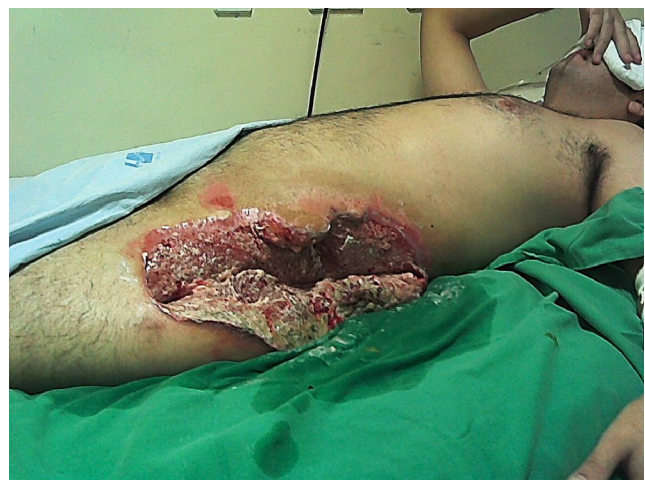
Fig. 4 – Image of flank and hip, undergoing secondary healing process (granulation tissue).

are most likely to suffer such injuries are the anterolateral thigh, gluteal, lumbodorsal and scapular regions. 6-8,12,14