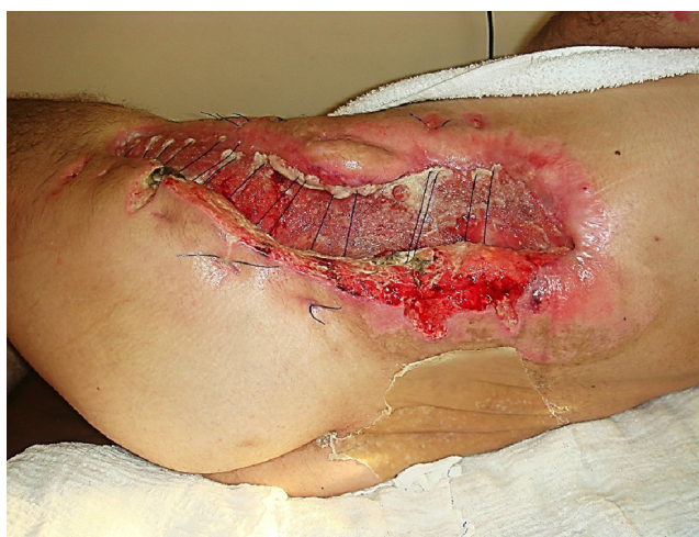
Fig. 6 – Attempt to bring together the edges of the wound, before constructing myocutaneous flaps.

that the subcutaneous tissue becomes detached from the muscle fascia, thereby injuring the vessels that pass through these layers. 4,5,15 The hemolymph fluid becomes surrounded by granulous tissue, which may lead to formation of a fibrous pseudocapsule, prevention of fluid reabsorption and predisposition toward bacterial colonization and infection. 9,11-14