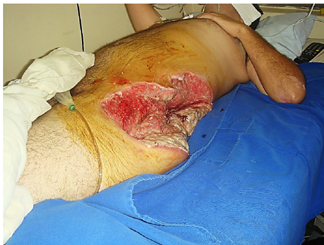
Fig. 5 – Image of flank and hip, undergoing secondary healing process (granulation tissue).