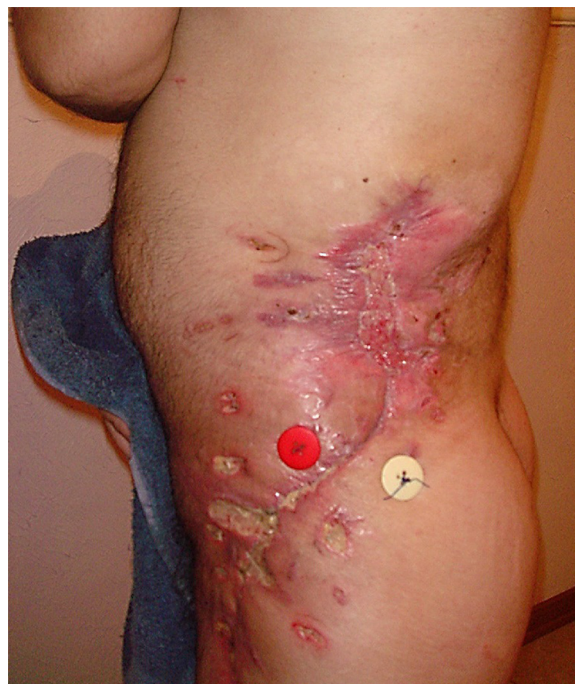
Fig. 7 – Final image after performing grafting.

Compromised circulation in the skin and subcutaneous tissue in the injured segment is always observed and