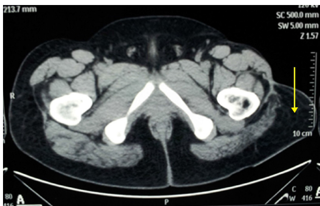
Fig. 2 – Axial tomographic slice showing large accumulation of fluid (arrow), between the subcutaneous tissue and muscle fascia.