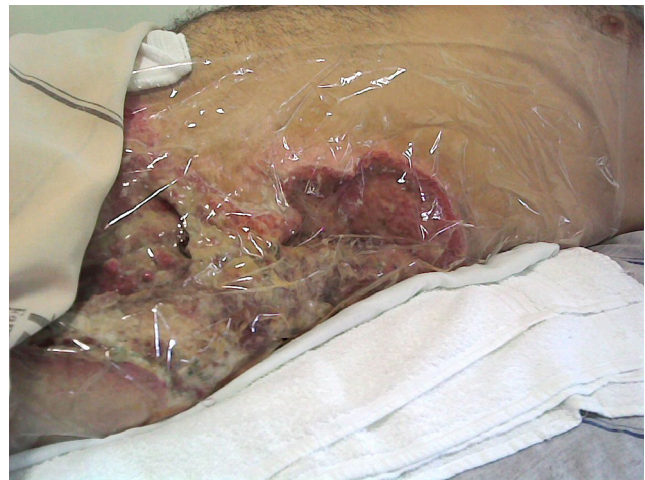
Fig. 3 – Image of flank and hip after initial debridement, showing necrosis and infection.

MLL, or degloving injury, is a rare form of soft-tissue injury that is associated with high morbidity. 12,14,15 The areas that