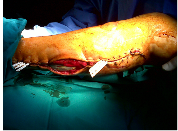
Fig. 3 – Suturing of the fasciotomy sites was performed progressively and no skin grafts were necessary.

of the lower leg and hypoesthesia on the heel, internal face of the foot and first and second toes of the right foot. Because she was walking with a hanging foot, an anti-equinus splint was prescribed. On the 40th postoperative day, the patient was walking with the aid of a frame and was using a splint. She was advised to undergo rehabilitation at a continuing care unit, with intensive physiotherapy. Two months after the operation, she was still having physiotherapy and continued to present a deficit of dorsiflexion in her right foot, with swelling of the posterior muscles of the lower leg, and was using a splint to stabilize her gait. She was being followed up as an orthopedics outpatient, with improvement of right-knee joint range of motion and walking with crutches (Figs. 4 and 5).