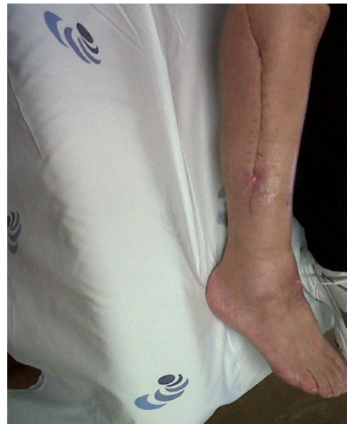
Fig. 4 – Two months after the operation, the patient was still undergoing physiotherapy and the deficits of dorsiflexion in the right foot remained, with swelling of the posterior muscles of the lower leg.

of the lower leg and hypoesthesia on the heel, internal face of the foot and first and second toes of the right foot. Because she was walking with a hanging foot, an anti-equinus splint was prescribed. On the 40th postoperative day, the patient was walking with the aid of a frame and was using a splint. She was advised to undergo rehabilitation at a continuing care unit, with intensive physiotherapy. Two months after the operation, she was still having physiotherapy and continued to present a deficit of dorsiflexion in her right foot, with swelling of the posterior muscles of the lower leg, and was using a splint to stabilize her gait. She was being followed up as an orthopedics outpatient, with improvement of right-knee joint range of motion and walking with crutches (Figs. 4 and 5).