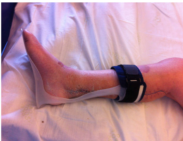
Fig. 5 – Anti-equinus splint prescribed because the patient was walking with a hanging foot.