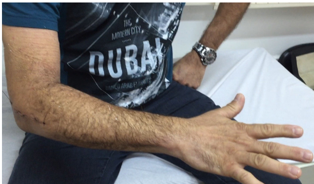
Fig. 5 – Patient on the fifth postoperative day. Complete metacarpophalangeal joint extension is observed.

innervation of the triceps, anconeus, extensor carpi radialis longus and brevis muscles. 6-8