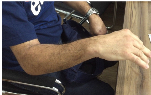
Fig. 1 – Photograph of the patient showing extension of the fingers at the level of the metacarpophalangeal joints disability.

Elbow radiographs were initially requested and a Mason type III radial head fracture was observed, with an anteriorly deflected fragment consisting of 40% of the radial head area (Fig. 2). To better understand and visualize the fracture, a CT scan of the elbow was performed and associated fractures were observed (Figs. 3 and 4). Given the fracture pattern and neurological deficit, surgical treatment was chosen.