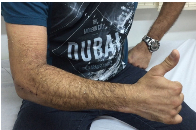
Fig. 6 – Patient on the fifth postoperative day. Complete thumb extension and abduction are observed.

The PIN is a motor branch of the radial nerve; it has six sub-branches, which are responsible for the innervation of the extensor digitorum communis, extensor indicis proprius, extensor pollicis brevis and longus, abductor pollicis longus,