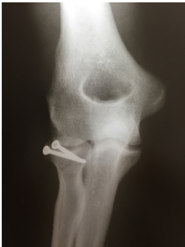
Fig. 8 – Postoperative elbow AP radiograph showing the fixation of the radial head fracture with two micro fragment screws.

temporary PIN dysfunction was due to compression by both the intra-articular hematoma and the anterior displacement of the radial head fragment.