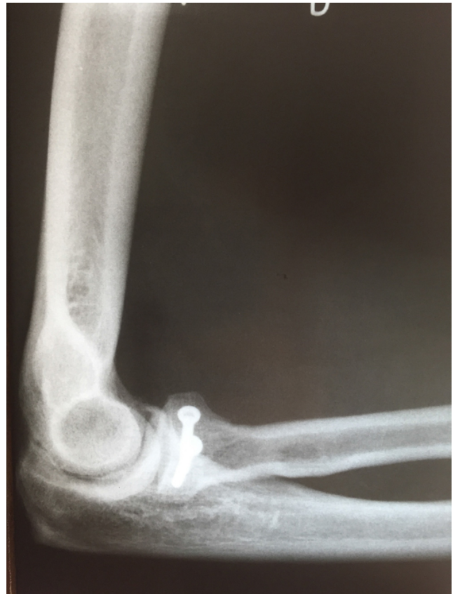
Fig. 7 – Postoperative lateral view elbow radiograph in showing the fixation of the head fracture with two micro fragment screws.

supinator, and extensor carpi ulnaris muscles. The branch to the supinator muscle emerges before the nerve enters the arcade of Frohse, and the other branches emerge afterwards. 6 Due to this subdivisions, Spinner 6 divided PIN compression into two types: type I, in which all branches are compressed, and type II, in which the isolated compression of a branch may occur.