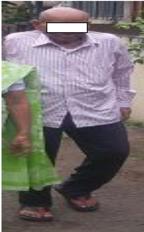
Fig. 6 – At 10 follow-up 7 months full weight bearing walking.

using modified Stoppa approach. They concluded that internal fixation of quadrilateral plate fracture should be considered a viable alternative to total hip arthroplasty for the initial treatment of acetabular fractures in the elderly.