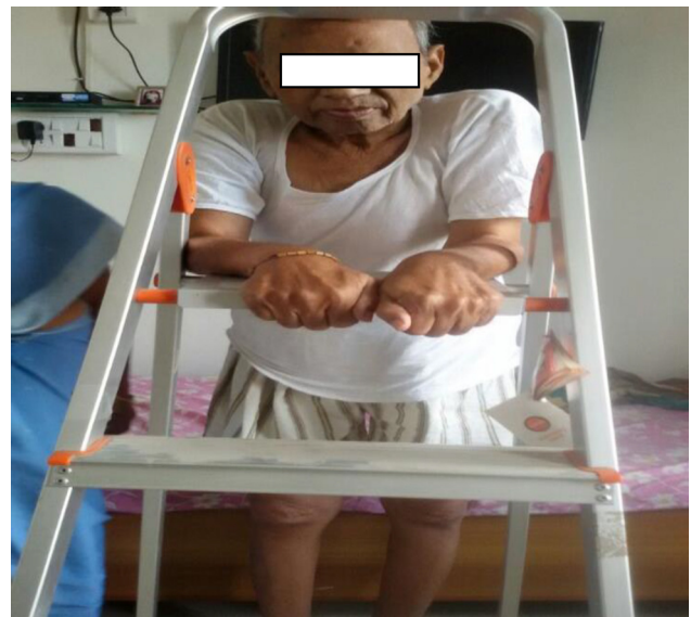
Fig. 4 – At 2 months follow up patient standing with support.

Laflamme et al., 8 in 2011 reported good to excellent result of 21 patients having displaced quadrilateral plate fracture with established osteoporosis fixed with infrapectineal plating