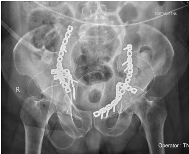
Fig. 3 – Immediate post-operative X-ray showing fixation of bilateral quadrilateral plate fracture.

Bilateral open reconstruction with fixation of quadrilateral plate fracture (Fig. 3) was done one of the authors (VS) on 12th post-operative day to primary surgery using ilio-inguinal approach with patient in supine position. Two prebent 3.5 mm reconstruction plate was used on right side and one 3.5 mm reconstruction plate on left side. Prebent plates were reinforced by 3.5 mm reconstruction plate over pelvic brim. Reduction was assessed under C-arm and was satisfactory.