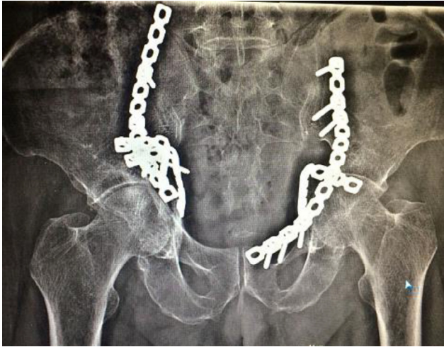
Fig. 5 – At 7 months follow up X-ray shows well maintained congruent reduction of hip.