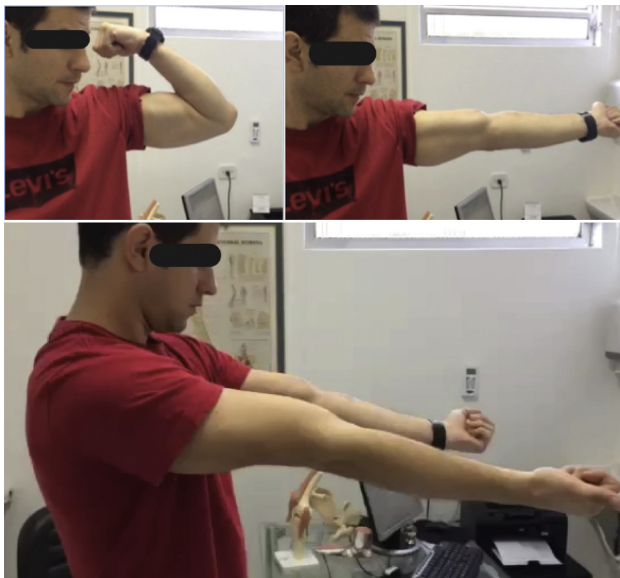
Figure 3 – Six-month postoperative images of one of the athletes, demonstrating adequate range of motion and physical appearance equal to that of the contralateral limb.

spontaneous resolution three months after the procedure. The above-elbow splint was removed after two weeks, and a simple sling was maintained until the sixth postoperative week.