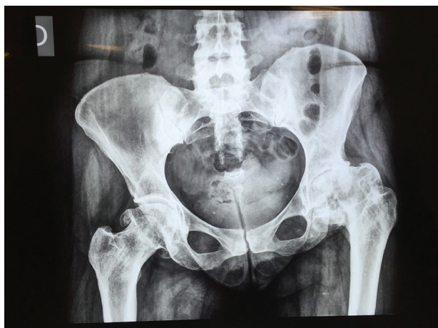
Fig. 1 Posterior-anterior hip radiography—bilateral coxarthrosis and lower left limb shortening.

The patient was submitted to a spinal anesthesia with codeine analgesia, with no motor block. In right lateral recumbency position, electroencephalographic monitoring electrodes were placed and successive evoked potential tests