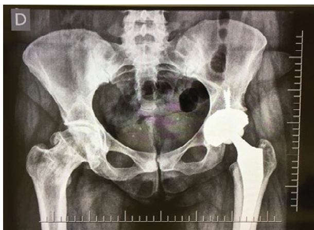
Fig. 3 Demonstrative photograph of residual dysmetria in postoperative malleolar evaluation.

Gluteus maximus tenotomy is described for the treatment of deep gluteal pain, which can result from non-discogenic compression (sciatic nerve compression). 5 The description of this procedure as a protective measure against sciatic nerve injury during THA (as presented by the authors) requires studies with greater scientific evidence. Nevertheless, the electro-neurophysiological results presented here support us to stimulate large centers in performing prospective clinical studies to ratify these results.