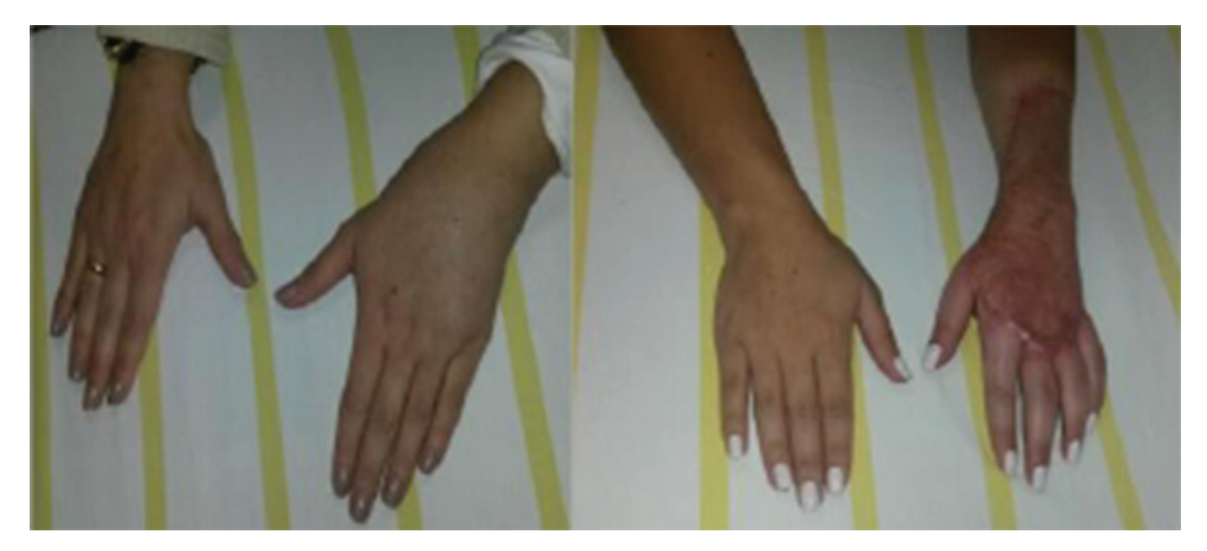
Fig. 1 A, admission; B, 1<sup>st</sup> month after the surgery.

Depending on the degree of cellularity, nuclear pleomorphism, and mitotic activity, myxofibrosarcomas are classified into three histological grades: low, intermediate, and high grade.<sup>1,2</sup> In the present case, the nonspecific physical and imaging features initially led to the misdiagnosis of a benign lesion, delaying treatment for > 2 years. The MRI scans showed characteristic images, such as the high signal in T2-weighted images seen in myxoid tumors, and a low signal in those with fibrosis. Although the nuclear magnetic resonance (NMR) findings did not confirm the diagnosis, they helped the surgical planning.