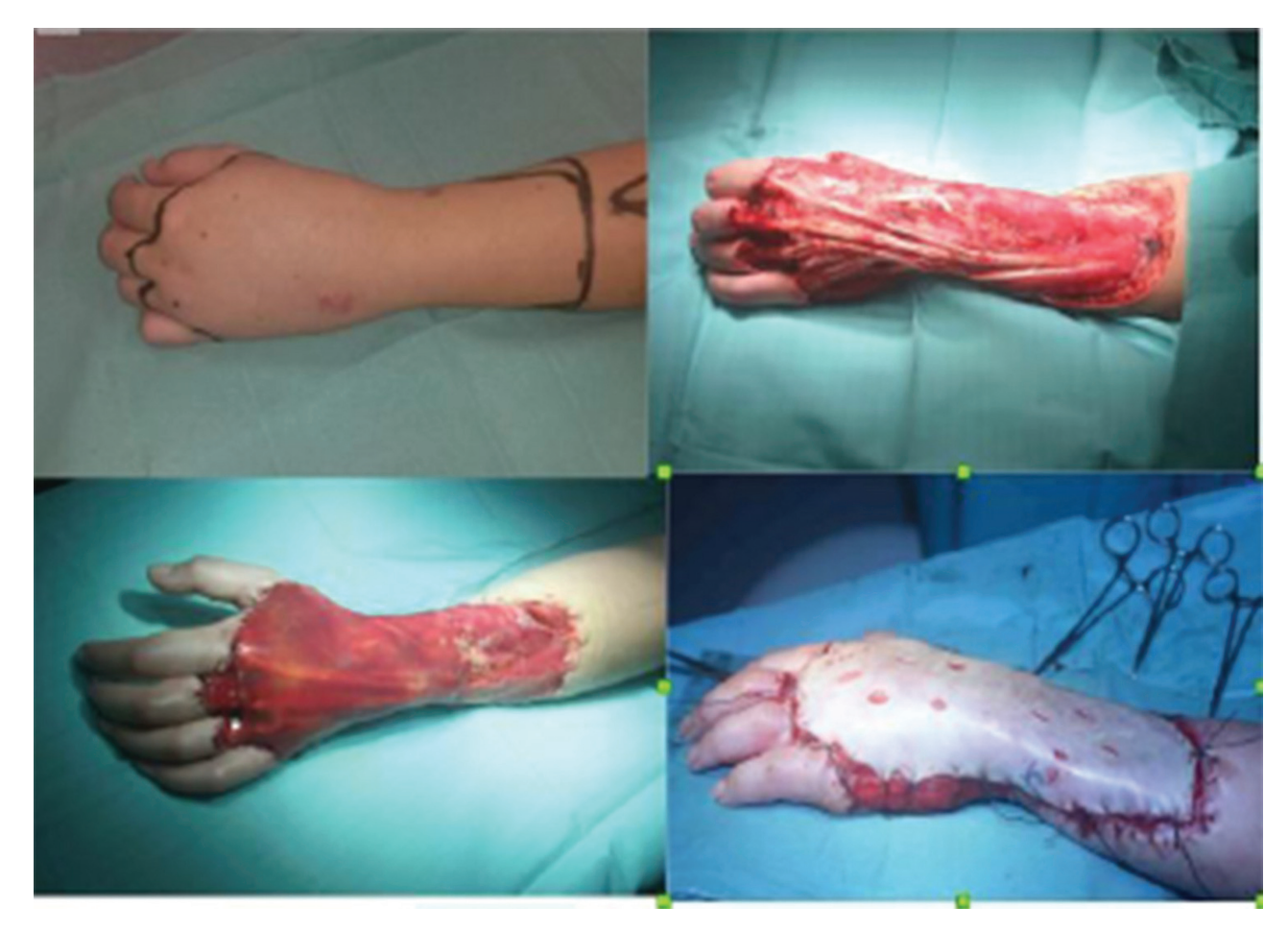
Fig. 4 Transoperative period of tumor resection. A, intraoperative marking; B, wide resection; C, reconstruction with dermal matrix; D, second surgical time with total skin graft.