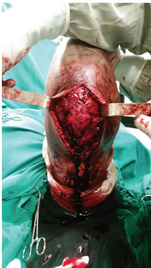
Fig. 3 Final configuration of the reinforcement made with long palmar muscle tendon graft.