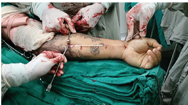
Fig. 2 Graft removal (long palmar muscle tendon).