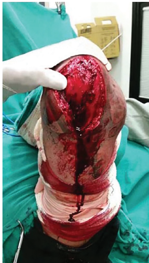
Fig. 1 Posterior surgical approach.

The patient was evaluated using an isokinetic dynamometer (CybexII+, New York, NY, USA) both preoperatively and 5 months after surgery. Flexion-extension was evaluated. The right arm was used as the control side.