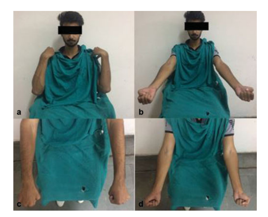
Fig. 5 At 12 months, range of motion; (a) flexion, (b) extension, (c) supination, (d) pronation.

Diagnosing and reducing the dislocation promptly is of utmost importance. There are some complications associated with this injury, like stiff elbow, recurrent radial head instability, and problems associated with Kirschner wire fixation. Recurrent radial head instability is addressed based on the congruence of the radial head reduction. If the radial head can be congruously reduced, annular ligament reconstruction is