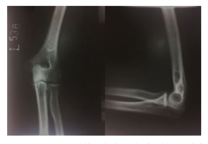
Fig. 4 Anteroposterior and lateral radiographs after the removal of the Kirschner wire at 6 weeks.