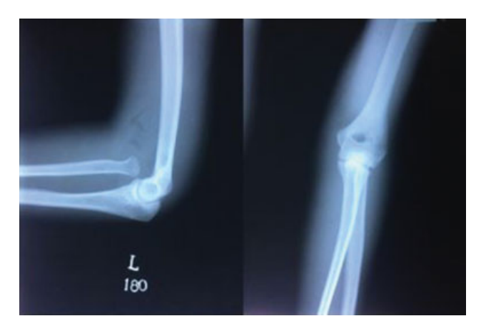
Fig. 1 Anteroposterior and lateral radiographs of the left elbow showing isolated anterior radial head dislocation.

pouch sling, an ice pack and analgesics, and was advised about the need for open reduction. The Boyd approach was used for exposure of the radial head. A plane was made between the extensor carpi ulnaris (ECU) and anconeus muscles. Intracapsular button-holing of the radial head was found intraoperatively, and was released. The radial head was reduced with 90 degrees of flexion at the elbow joint and forearm in complete supination. However, the reduction was unstable due to rupture of the annular ligament. Hence, a repair of the annular ligament was performed. A radio-ulnar Kirschner wire was passed to maintain the reduction of the proximal radio-ulnar joint ( Fig. 3 ), thus keeping the annular ligament stress-free, facilitating its healing. A Plaster-of-Paris (POP) back-slab was placed. The postoperative distal neurovascular status was normal. The wire was removed after 6 weeks (>Fig. 4), and elbow mobilization started. The patient underwent a supervised physiotherapy program. At 12 months of follow-up, the range of motion of the patient was: 0-140 degrees of flexionextension arc, 70 degrees of pronation, and 85 degrees of supination ( Fig. 5 ), which is consistent with the reference values of the American Society for Surgery of the Hand. The patient had no limitations regarding the performance of daily activities, and returned to the pre-injury Tegner level of sports activity.