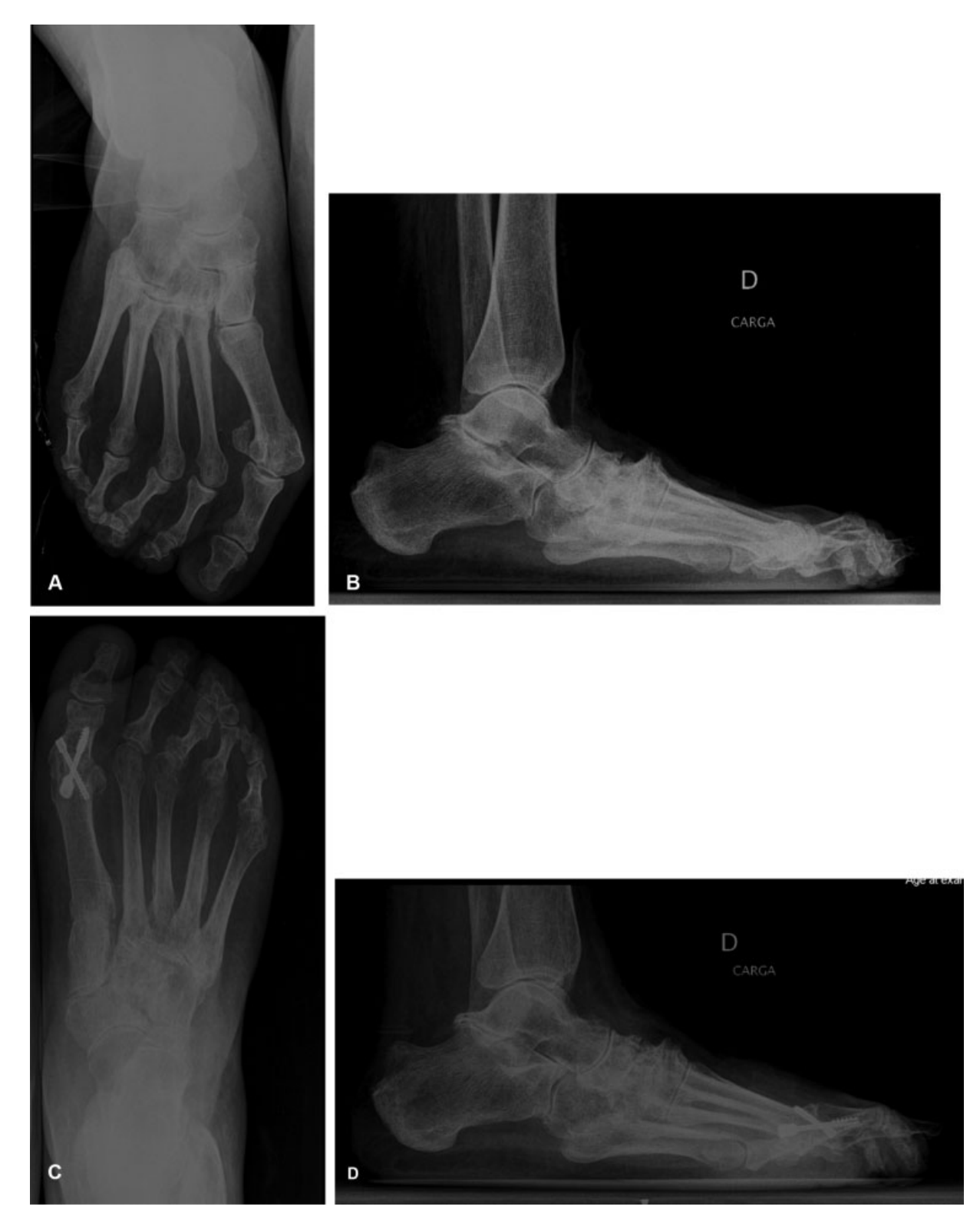
Fig. 4 Pre- and postoperative X-ray images of a 58 year old woman with hallux rigidus submitted to 1MTP arthroplasty. (A) Preoperative standing anteroposterior X-ray; (B) Preoperative standing lateral X-ray; (C) Postoperative standing anteroposterior X-ray 3 years after surgery; (D) Postoperative standing lateral X-ray 3 years after surgery.