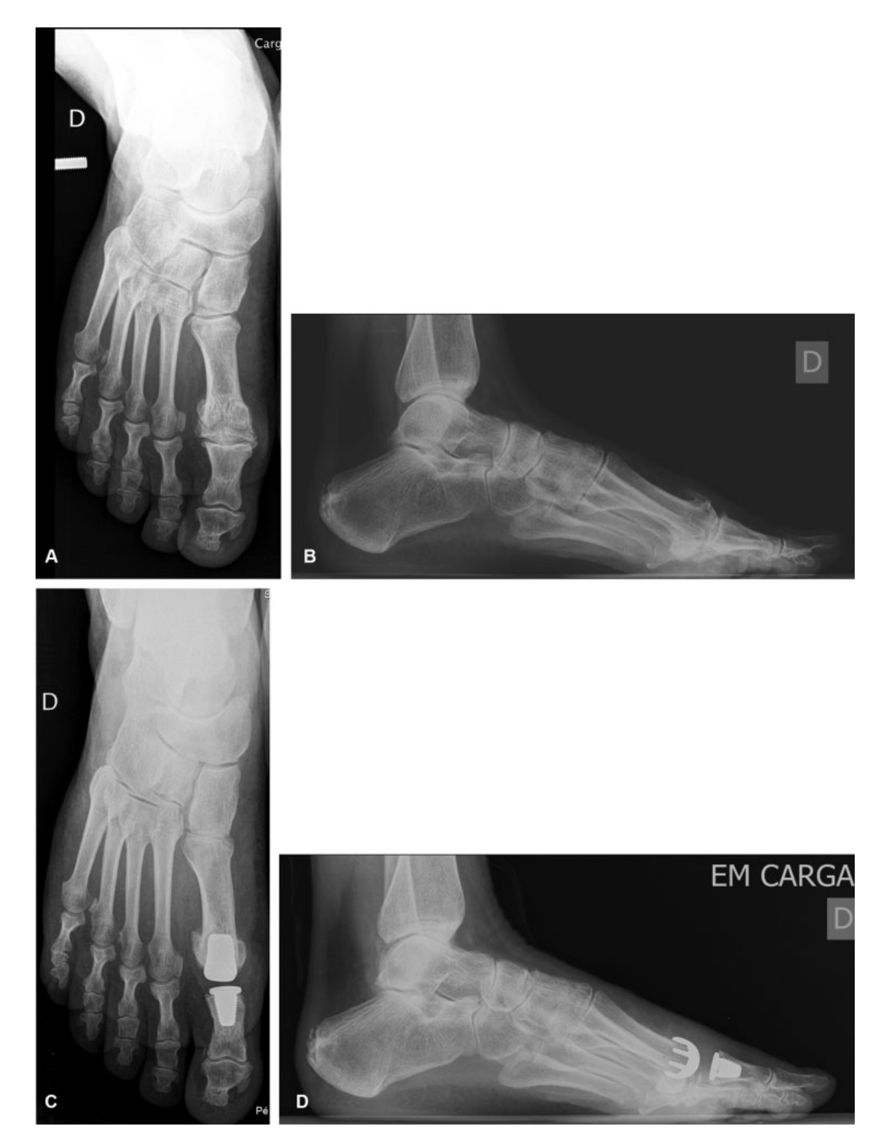
Fig. 3 Pre- and postoperative X-ray images of a 62 year old man with hallux rigidus submitted to arthrodesis with crossed-screws. (A) Preoperative standing anteroposterior X-ray; (B) Preoperative standing lateral X-ray; (C) Postoperative standing AP X-ray 2 years after surgery; (D) Postoperative standing lateral X-ray 2 years after surgery.