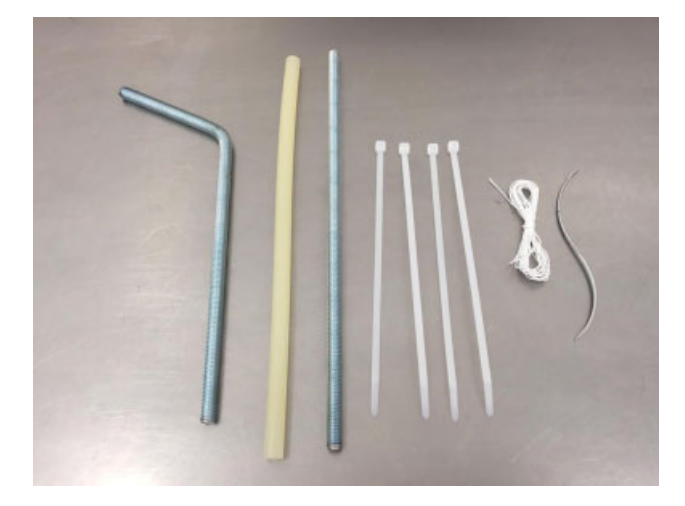
Fig. 1 Metal rebar, silicone tube, nylon clamp, suture and S-needle.

Lower-limbs reconstruction employs a 50-cm metal rebar with its proximal third premolded at a 135° angle for