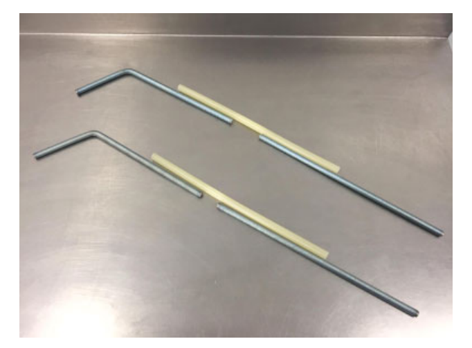
Fig. 2 Components for upper-limb reconstruction.

A hole is created with a chisel and hammer at the glenoid fossa, and, then, the humeral component is hammered to fit