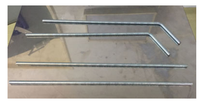
Fig. 4 Components for lower-limb reconstruction.

structural femur replacement and a 55-cm metal rebar for leg reconstruction ( - Fig. 4 ).