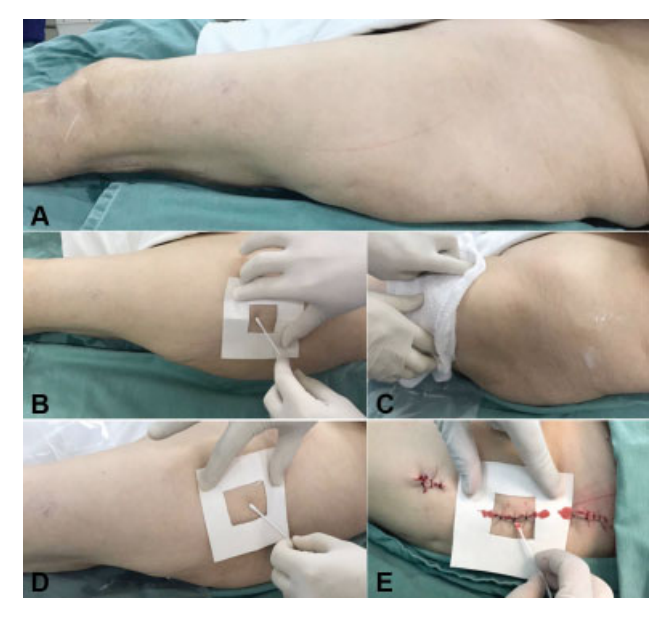
Fig. 1 Figures showing the time of sample collection. (A) Patient under anesthesia, with the surgical limb isolated with drapes; (B) sample collected before skin preparation; (C) skin preparation with chlorhexidine-based soap and excess removal; (D) sample collected after skin preparation; (E) sample collected at the end of the surgery, after surgical wound closure, with the patient still in the sterile environment.

After 48 hours of culture, the culture media were evaluated for organism growth. In case of growth, the number of colonies was counted, and Gram-positive ( Staphylococcus aureus and non- aureus ) and Gram-negative bacteria were identified. Samples from all time points, in both the mannitol and EMB media, were evaluated to verify if the number of colonies had decreased, increased or remained unaltered