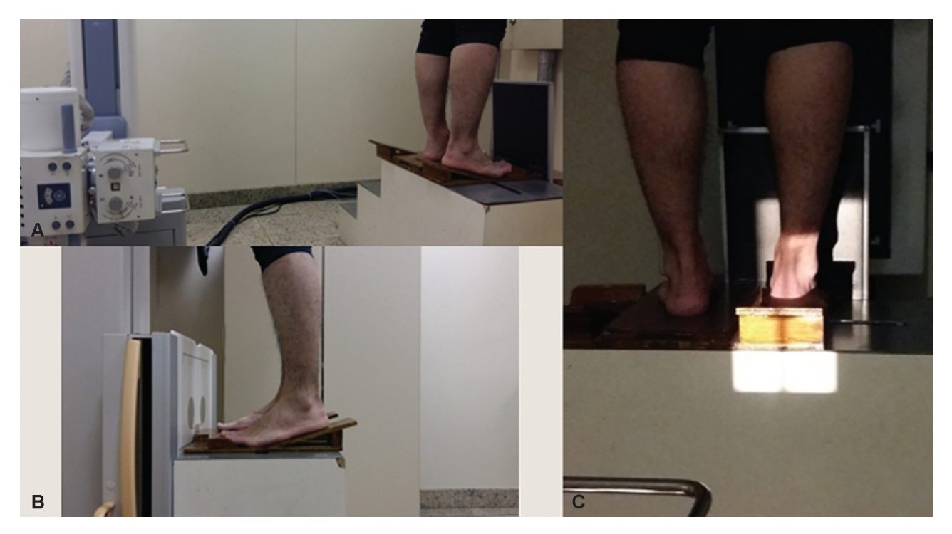
Fig. 1 Positioning of the patient for the acquisition of axial radiography of the forefoot with load. (A) radiographic ampoule at 1 m away from the film; (B) positioning of the ankle in 20° of equine, with 10° of finger extension in relation to the support; (C) total radiographed area.

Thirty-five individuals (70 feet) were evaluated. In the initial phase of the study, we were adjusting both the positioning of the device and the radiographic technique, so seven feet