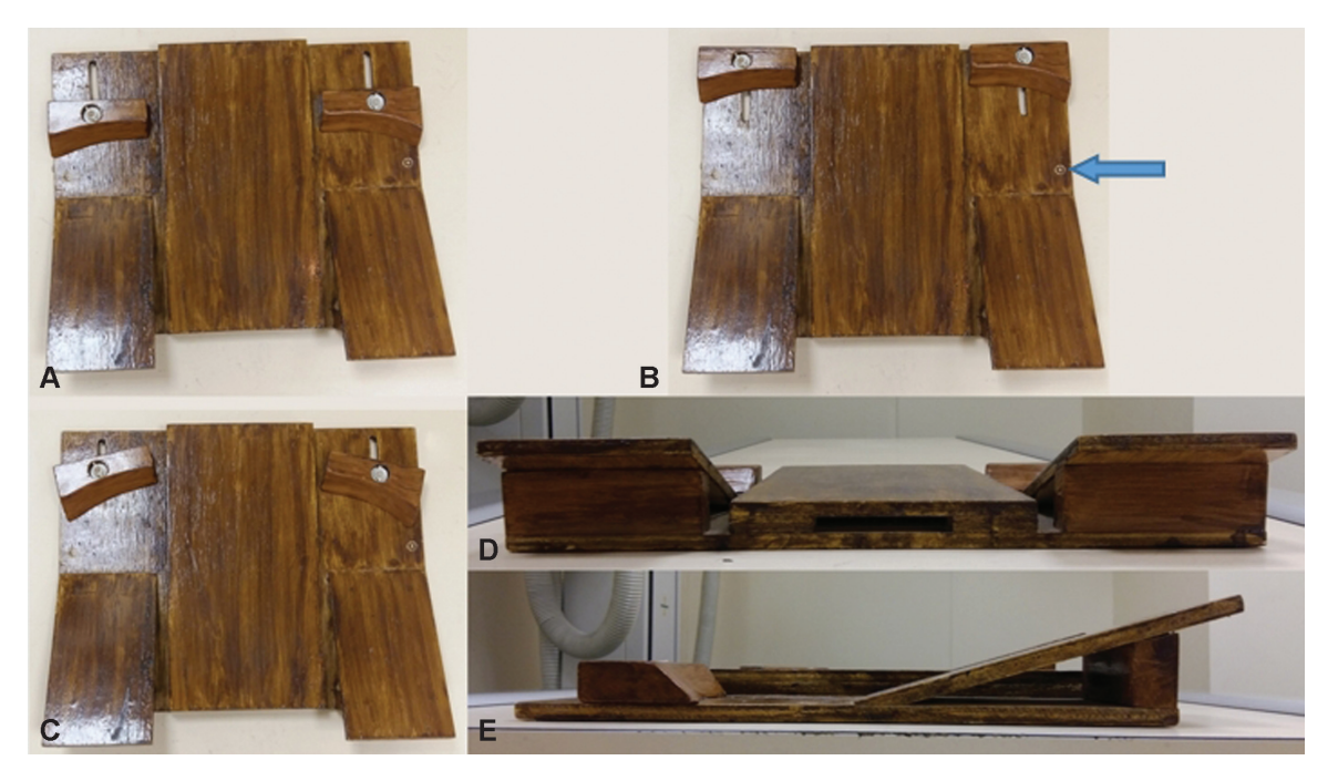
Fig. 2 Positioning bracket for radiographic acquisition. (A) top view with the anterior ramp in the most proximal position; (B) top view with the anterior ramp in the most distal position. Blue arrow indicating the positioning of the 5<sup>th</sup> metatarsal head; (C) top view with the previous round ramp to accommodate the fingers; (D) posterior view, evidencing the central support of the device for the positioning of the foot contralaterally to the examination; (E) side view, showing the anterior and posterior ramps.

were excluded due to poor radiography quality that made the evaluation impossible.