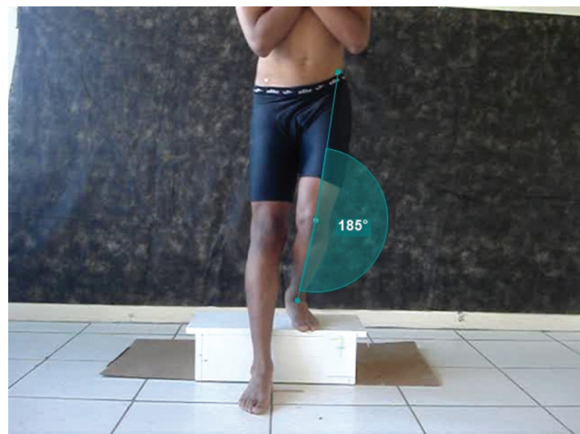
Fig. 2 Evaluation of the frontal plane projection angle (FPPA) of the knee using the step-down test in young soccer players (Kinovea software, version 0.8.24).