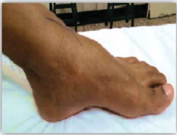
Fig. 1 Foot photograph in profile. Edema is noted in the dorsal region of the midfoot associated with an increase in the medial plantar arch.