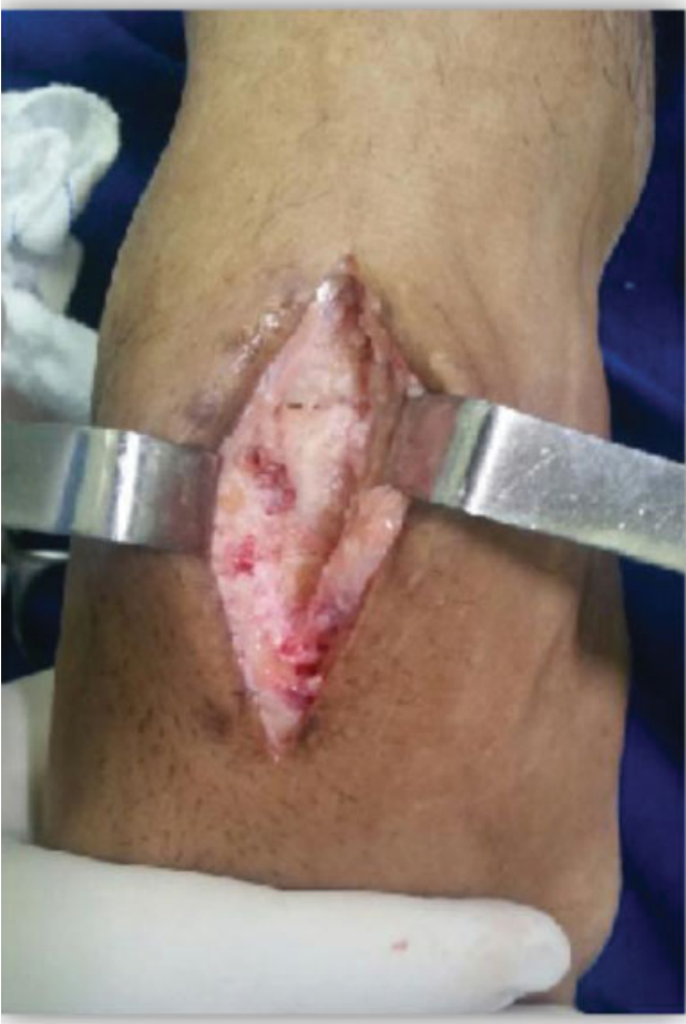
Fig. 5 Dorsal view of the midfoot showing the intraoperative appearance of the intermediate cuneiform bone after plaque removal.

In the last evaluation, 16 months after the 2 nd surgery, the patient reported that he performed running and impact activities without limitations or pain complaints. He classified the result as excellent and reports that he would perform the procedure again.