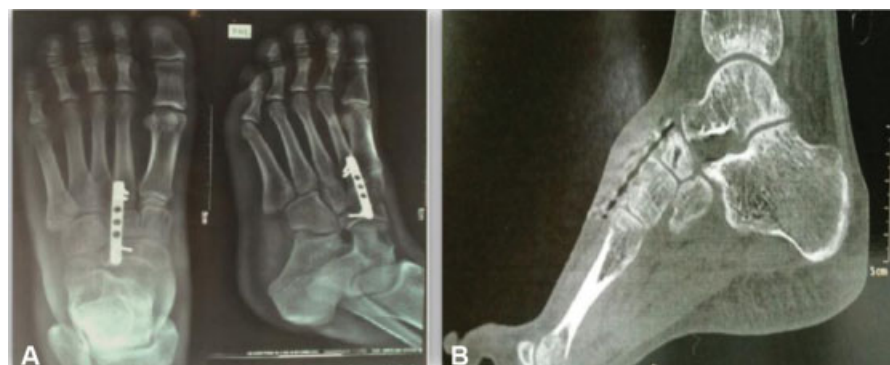
Fig. 4 Imaging tests performed six months after surgery. We evidenced incorporation of the bone graft. (A) Radiography. (B) Computed tomography.

The patient showed excellent evolution, underwent physical rehabilitation with return to sports activities without complications. Three months after the second surgery, the patient was already practicing light running and exercises without impact at the gym.